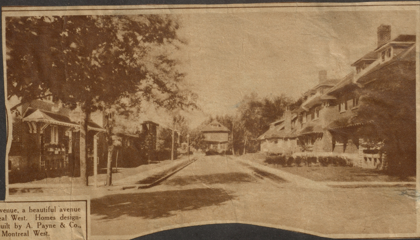
Curzon Avenue, a beautiful avenue in Montreal West. Homes designed and built by A. Payne & Co., Montreal West.

The homes shown in the Rotogravure section this week are typical examples of the artistic and substantial residences built by this progressive firm. They are situated on beautiful Wolseley Avenue, contain every modern improvement, and are all that one could desire in looks, quality, material and situation. For those who are seeking a comfortable home in a delightful location, no better or more suitable residences could be found. Make a point of seeing these lovely homes; you will be charmed with their distinctive attractiveness.