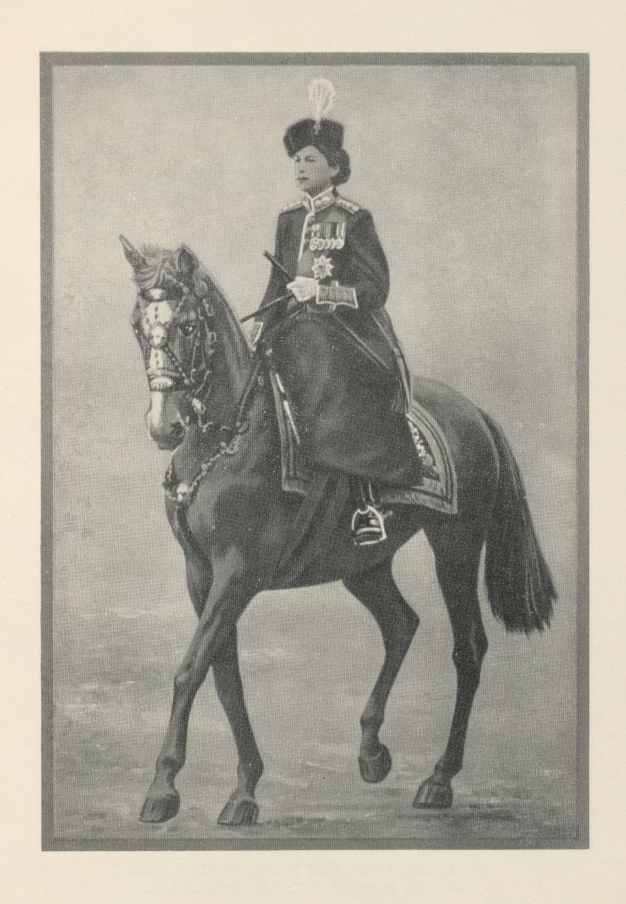
HER MAJESTY QUEEN ELIZABETH II Colonel-in-Chief of the Governor General's Foot Guards and Canadian Grenadier Guards