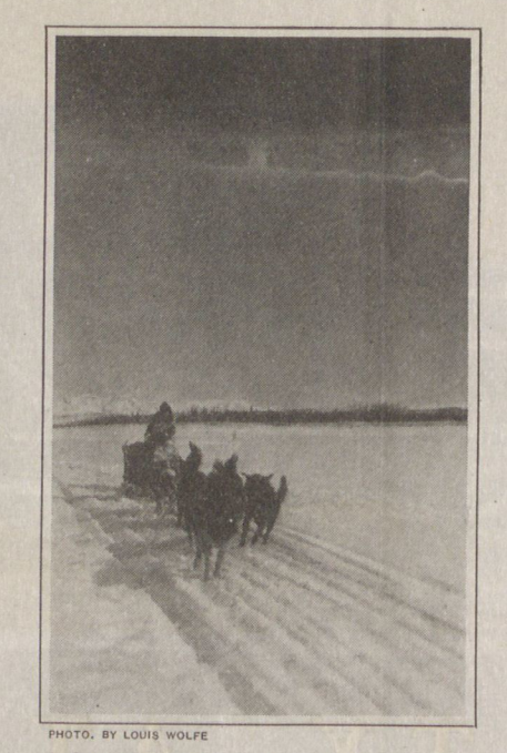
A Dog Team Traveling Down the Kuskokwim River on 7-Feet-Thick Ice, 200 Miles From the Benngala, at Napimute, Alaska

It may be of passing interest to note that more than 275,000,000 typographical symbols were used in this Herculean task, and that these tons of metal are always kept set up that the dictionary may be quickly