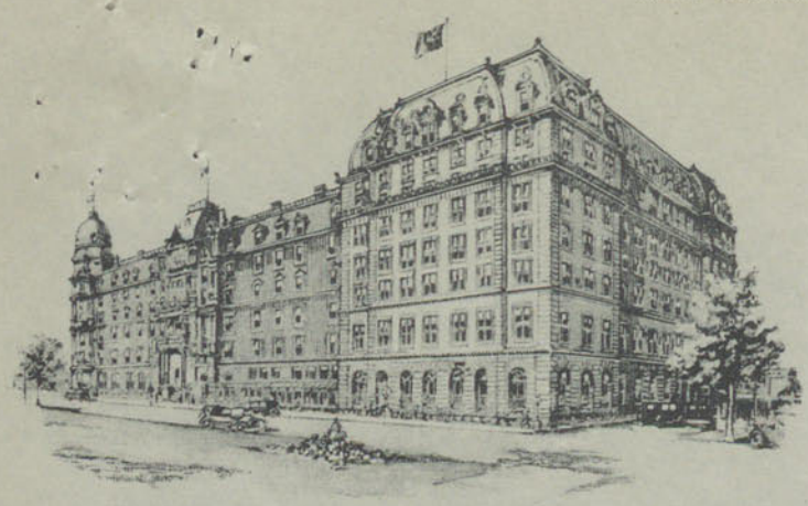
AFFILIATED WITH-THE WALDORF-ASTORIA, NEW YORK THE BELLEVUE-STRATFORD, PHILADELPHIA THE WILLARD, WASHINGTON, D. C.