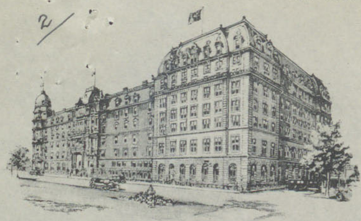
AFFILIATED WITH-THE WALDORF - ASTORIA, NEW YORK THE BELLEVUE - STRATFORD, PHILADELPHIA THE WILLARD, WASHINGTON D. C.