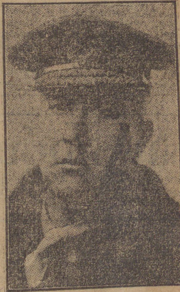
SIR ARTHUR CURRIE