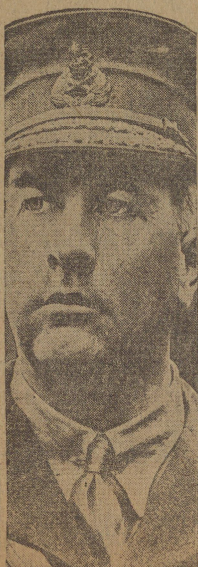
Principal and Vice-Chancellor of McGill University.