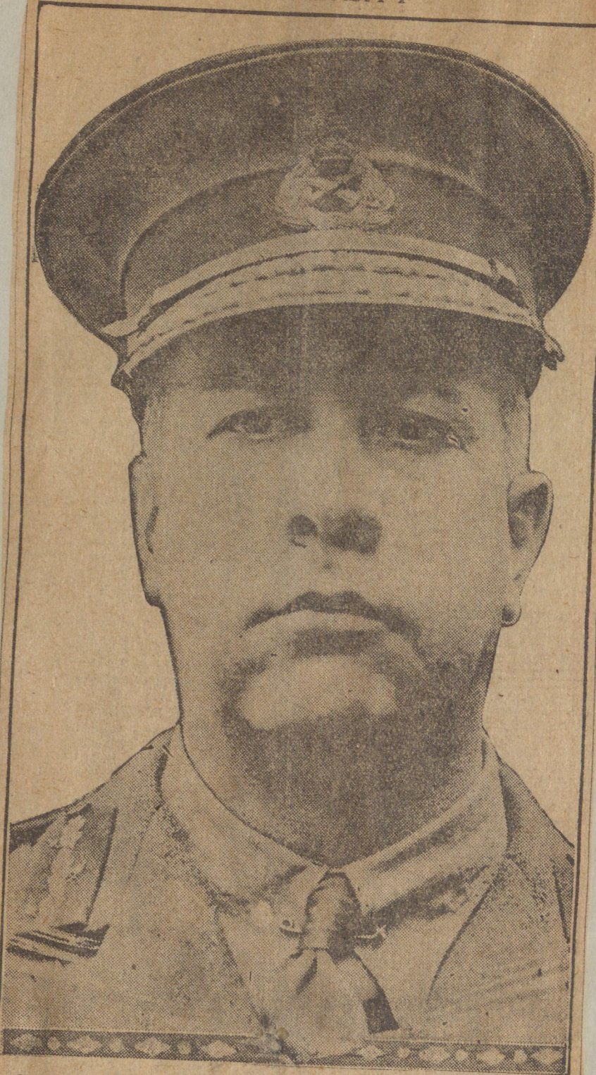
General Sir Arthur Currie, who was installed in office this afternoon.