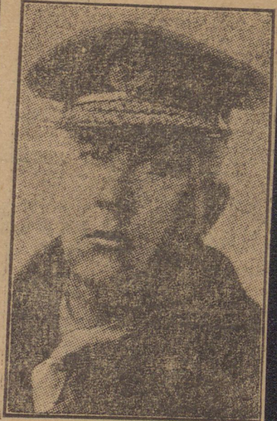
SIR ARTHUR CURRIE