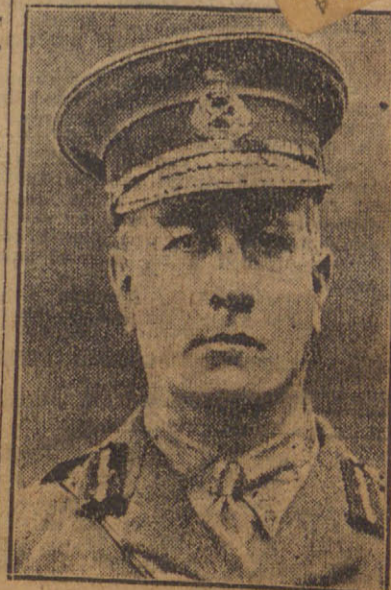
SIR ARTHUR CURRIE.

It is considered that the selection of General Currie as principal of McGill University will be a distinct advantage to that institution, not only from his war record, but by reason of his commanding personality, his ability as a speaker and writer, and his record as a citizen, who will be able