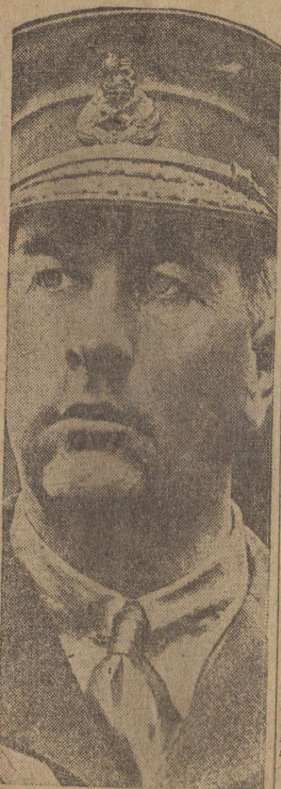
Principal and Vice-Chancellor of McGill University.