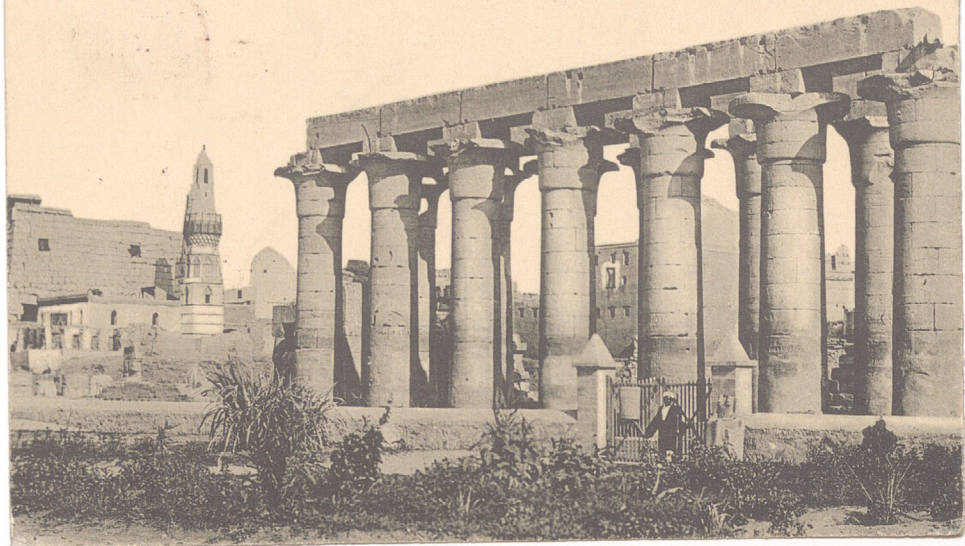
30 -- LOUXOR - Colonnades et Entrée du Temple