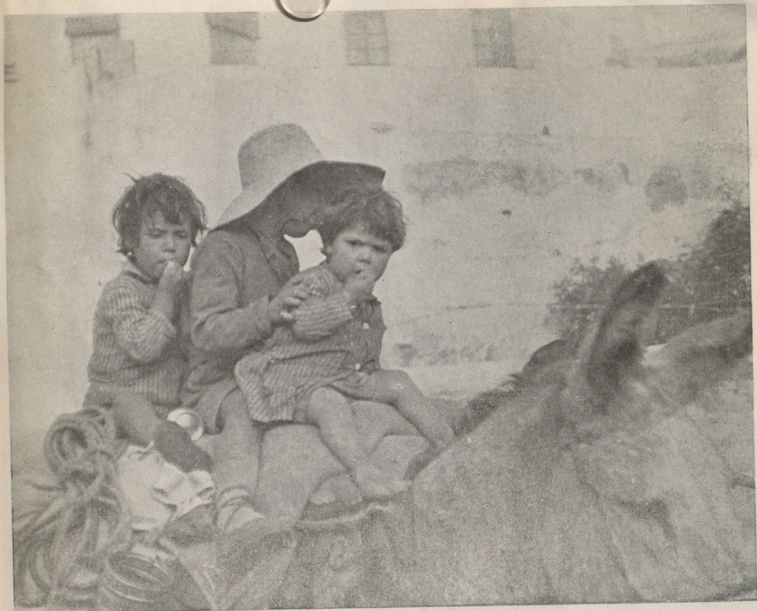
Tiny victims flee for safety.