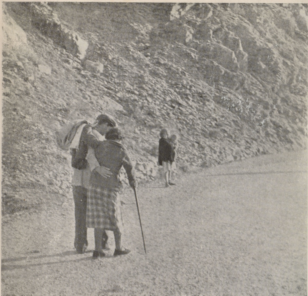
Foot - sore and weary.