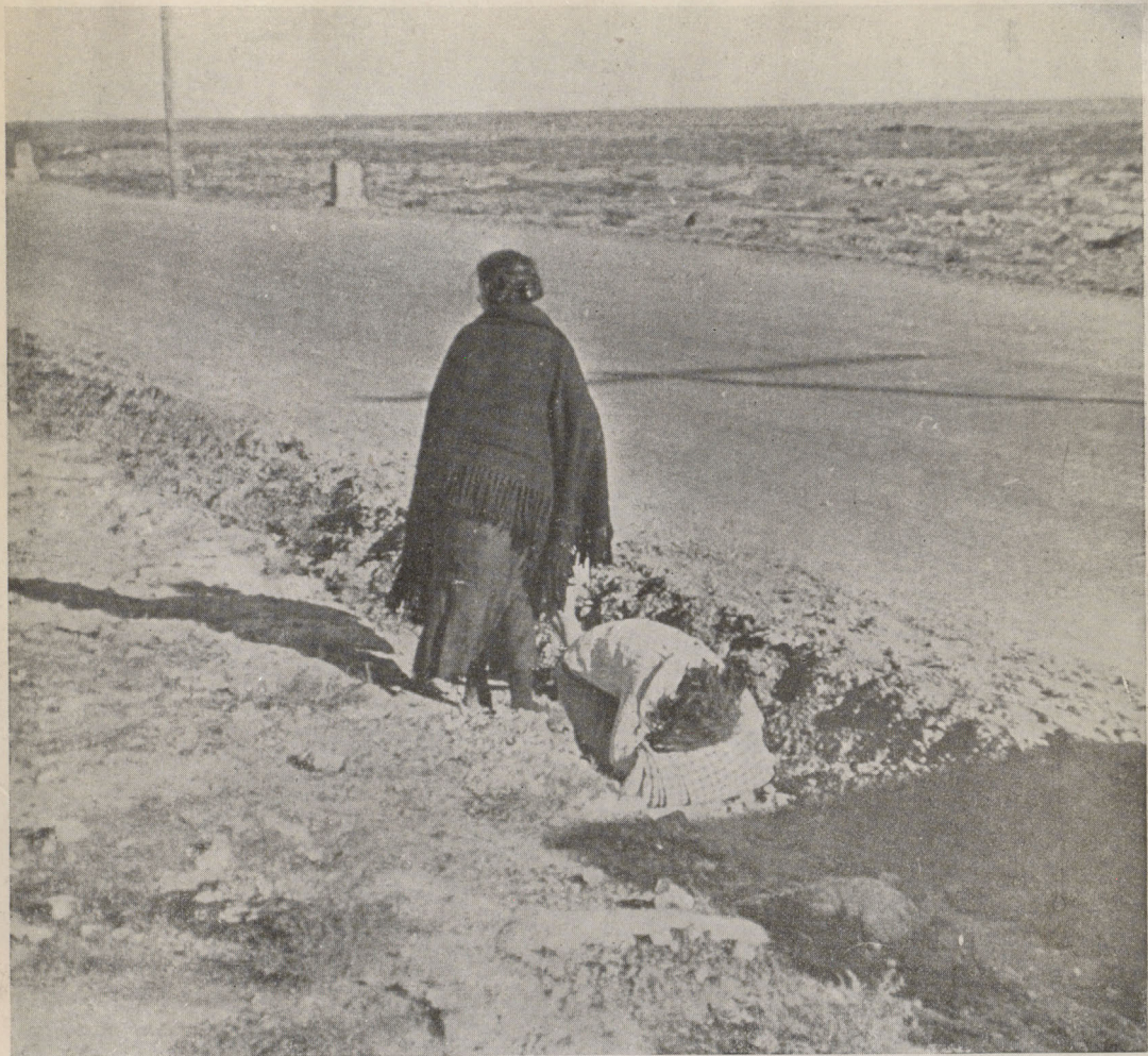
Hardly able to struggle on.