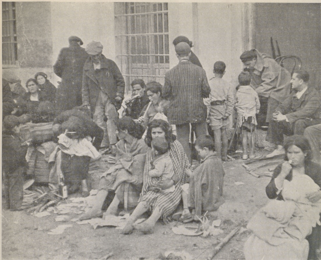
Sugar cane their only sustenance.