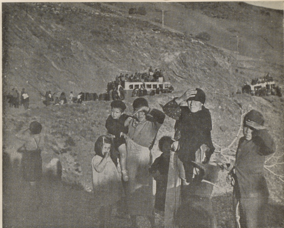
Waiting in vain for a lift.