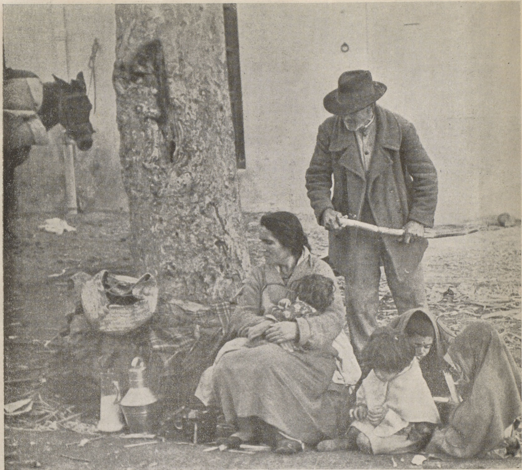
Exhausted by flight family halts for rest.