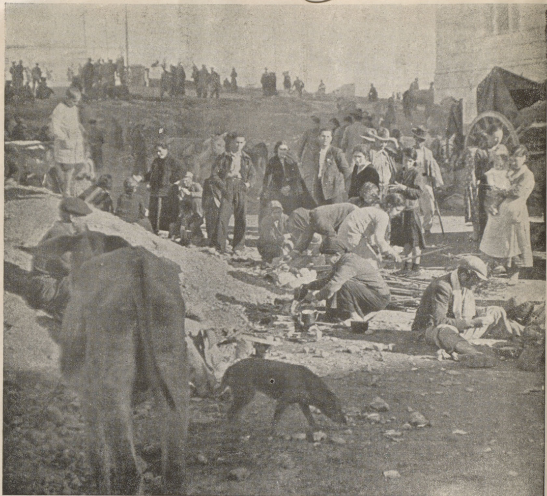
The endless procession takes a rest by the roadside.