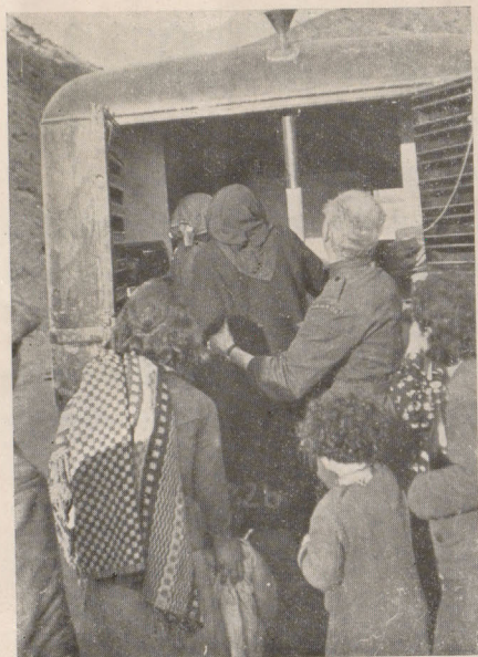
Helping the refugees to get into the ambulance

planes, the multitude continued their hasty march, their career of desperation and infinite anguish. Their goal was still very distant and they had no means of shortening it.