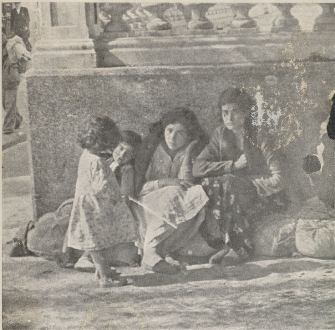
In Almeria, international machine-gunning also pursue fiercely the defenceless inhabitants of Malaga.