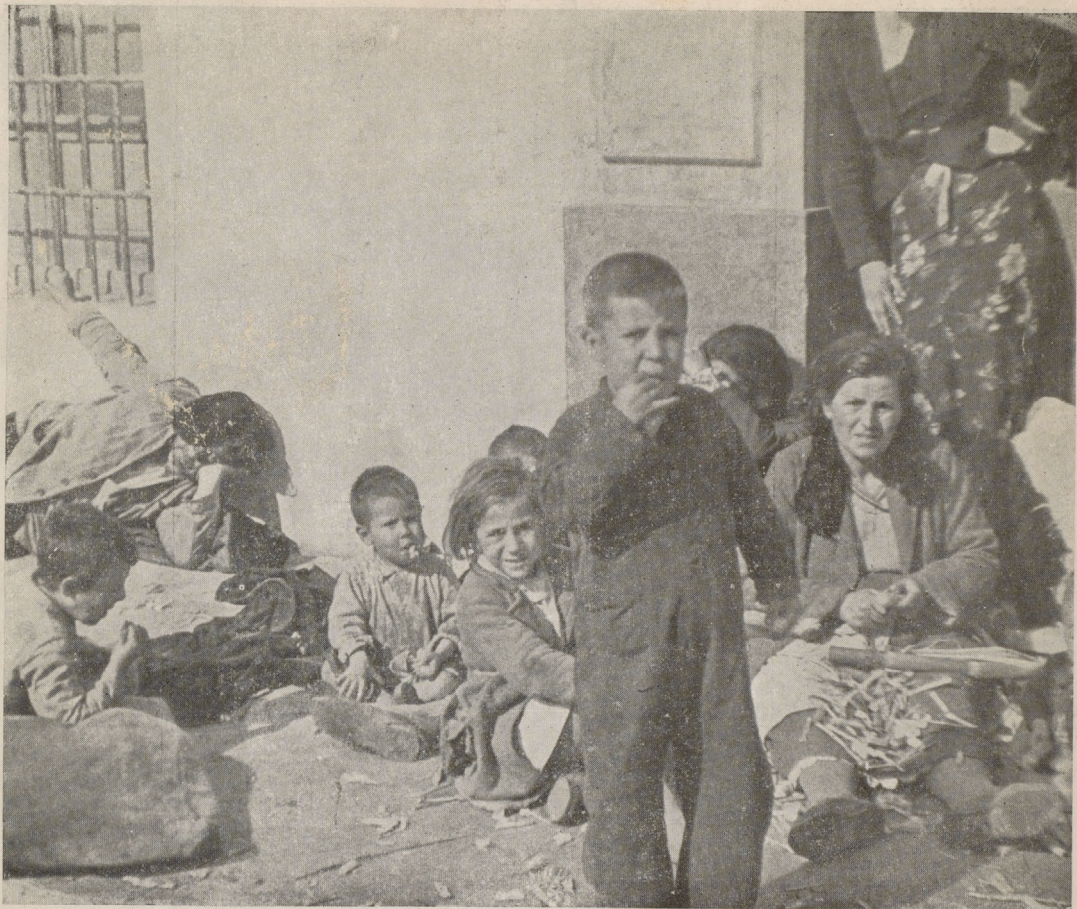
A family rests.