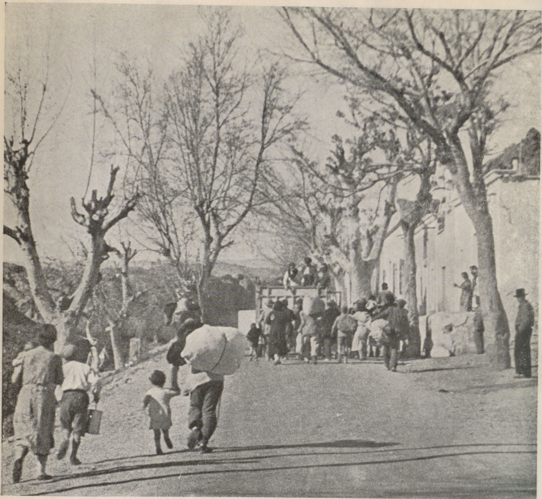
They passed by the villages along the road.