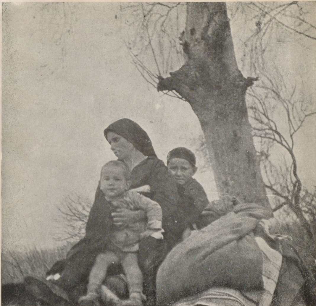
Her husband is dead. She must save her children.