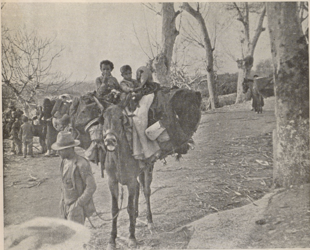
Malaga people sadly leave their home town, carrying with them the'r children and their household goods.