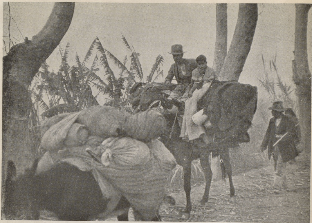
The trek to safety still goes on.