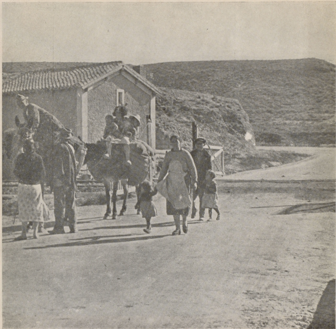
Even children must tramp along.