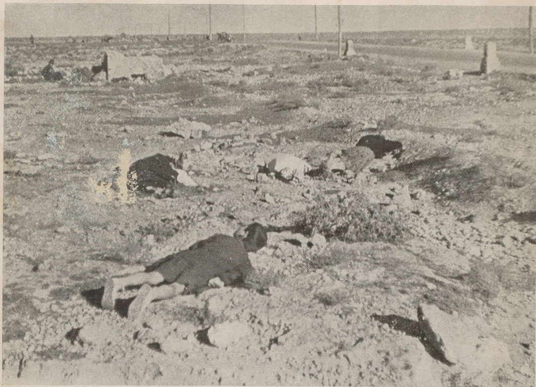
Collapsed along the length of the route.