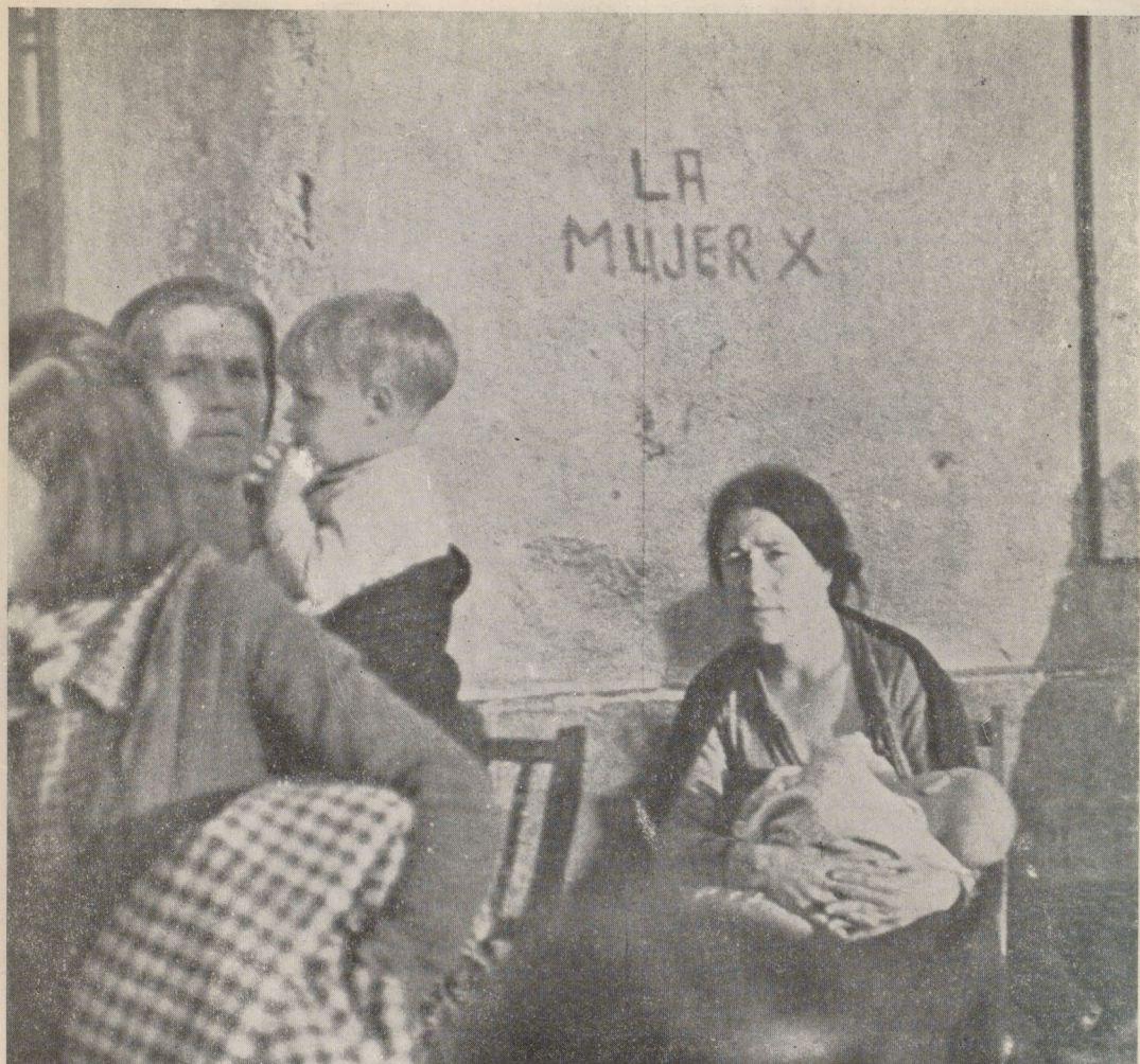
A brief respite in a roadside cottage.