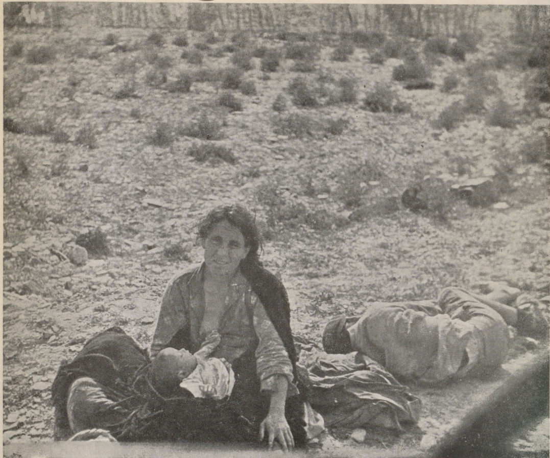
Waiting for help.