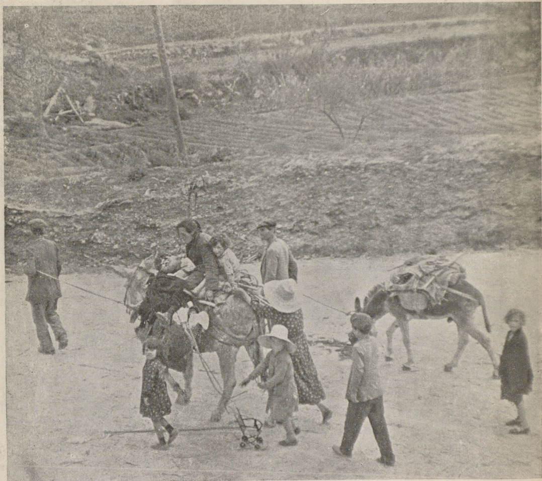
The children rescue what toys they can.