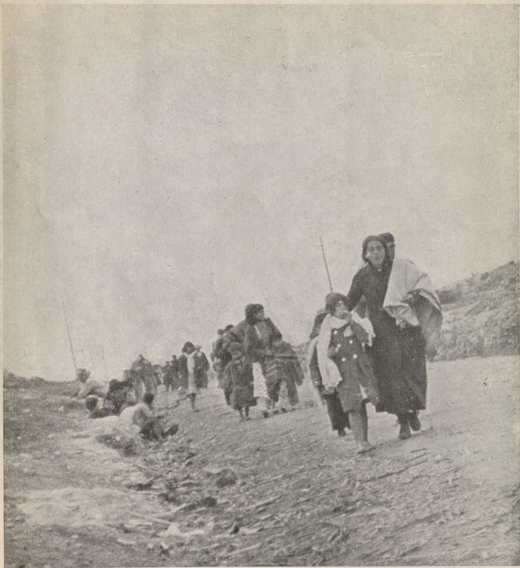
The endless procession.