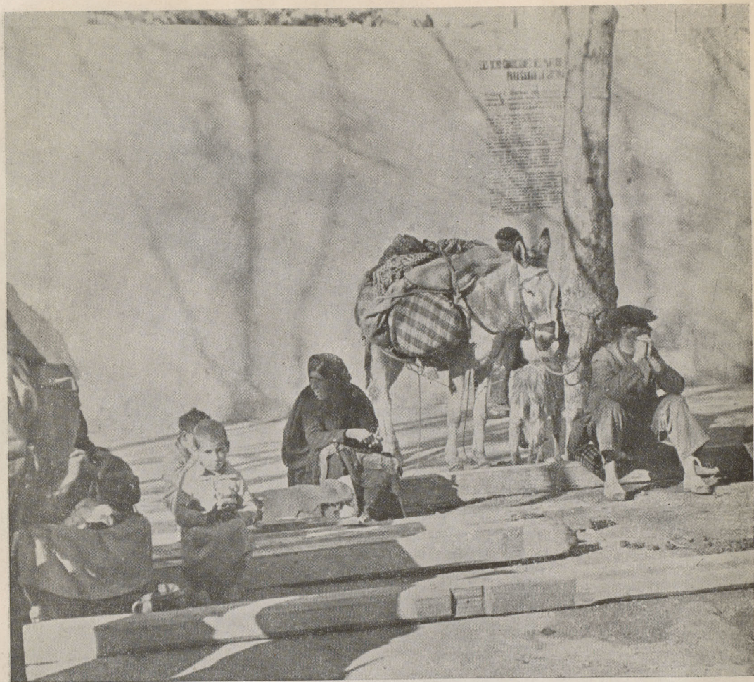
«Lunch time» - no bread, no water.