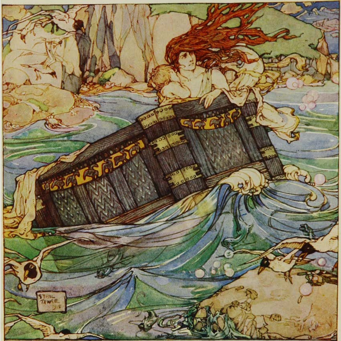
DANAE AND PERSEUS