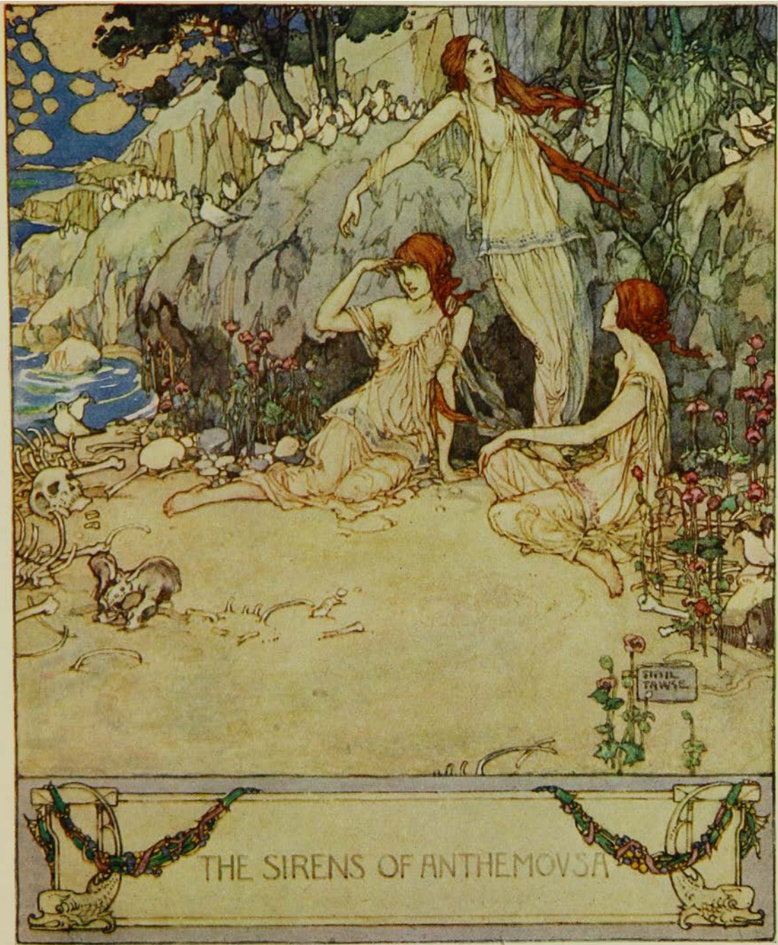
THE SIRENS OF ANTHEMOVSA