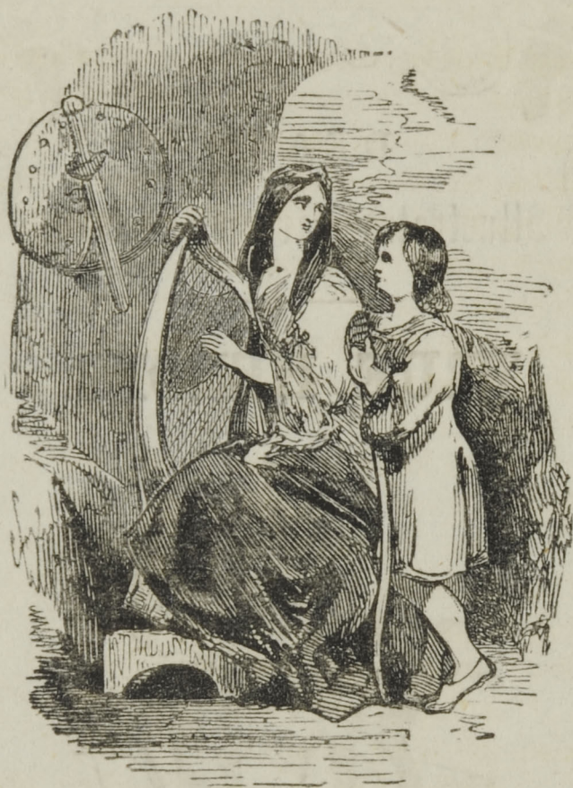
ALFRED THE GREAT.