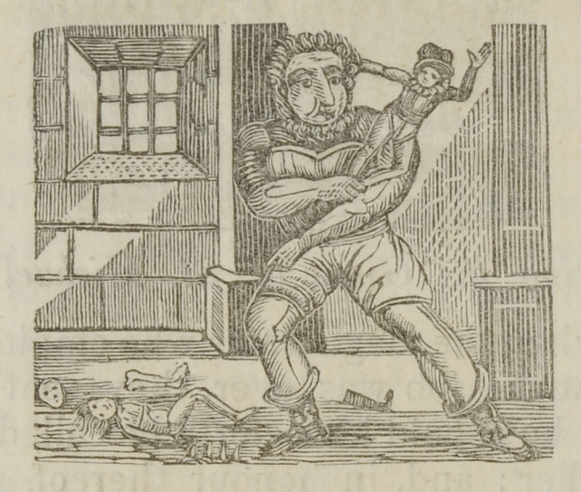
Jack in the enchanted Castle of the Giant Blunderbore.

suddenly seized him. At this time the giant going thither for water, found him; and, by the letters upon his belt, immediately knew him to be Jack: so without any words he took him upon his shoulder to carry him to his enchanted castle. As he passed through a thicket the rustling of the boughs awaked Jack, who, finding himself in the hands of the giant, was much surprised, though this was but the beginning of his terror. On entering the walls of the castle he found the floor