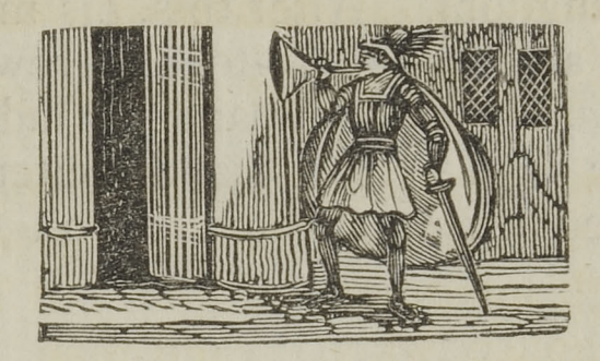
ack overthrowing the Magician and Giant by sounding the Trumpet.

As soon as Jack had read this he seized the trumpet and blew such a shrill blast as made the gates fly open, and the very foundations of the castle itself tremble.