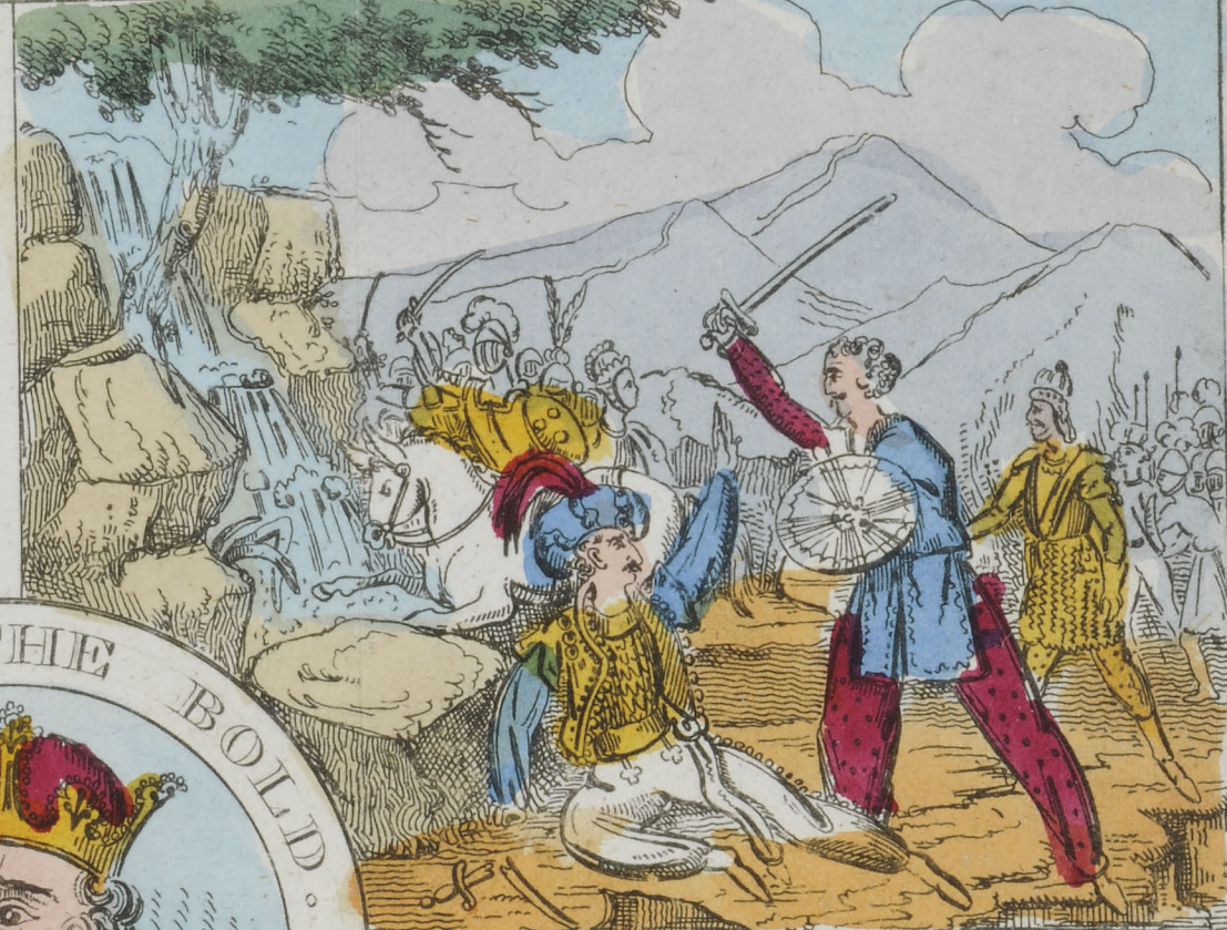
The Battle with Egbert's Troops & the Mountainers.