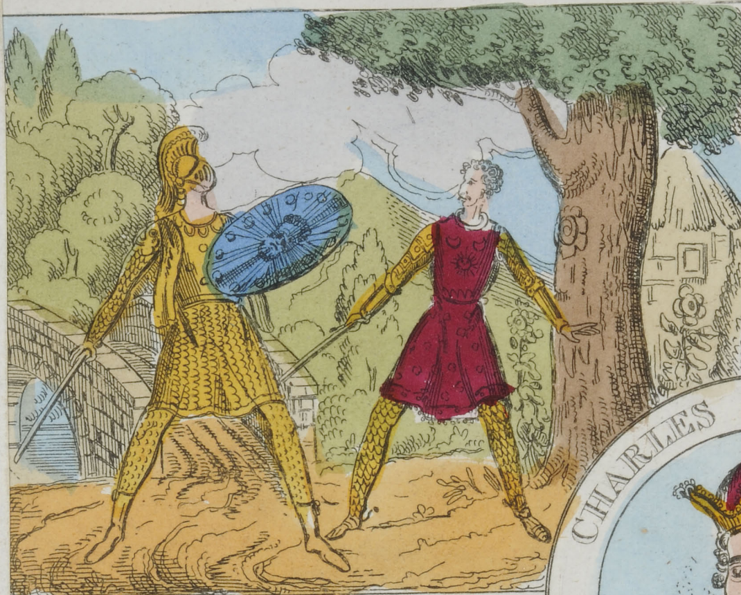
The Recluse Defending the Bridge.