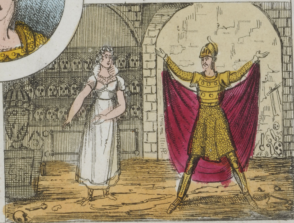
The Recluse & Elodie in the Bonehouse of Morat.