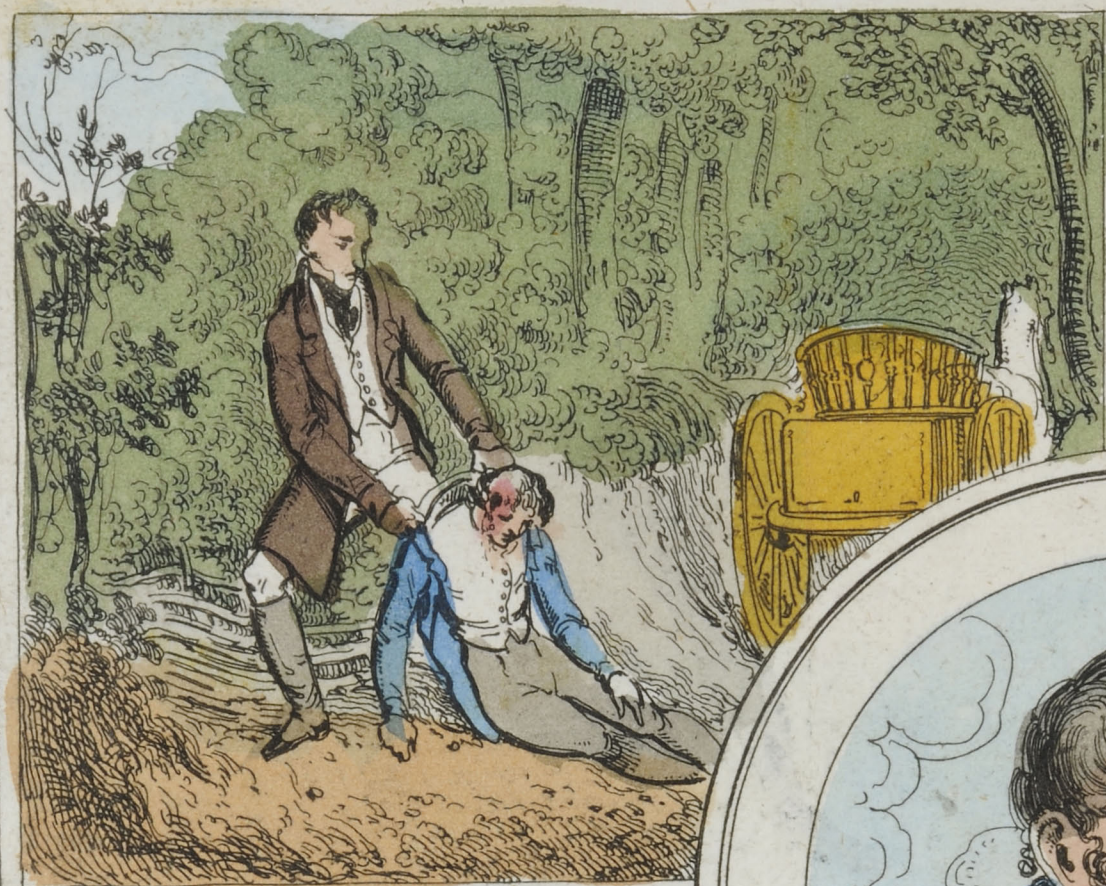
Thurtell in the act of murdering Mr. Weare in Gill's Hill Lane.