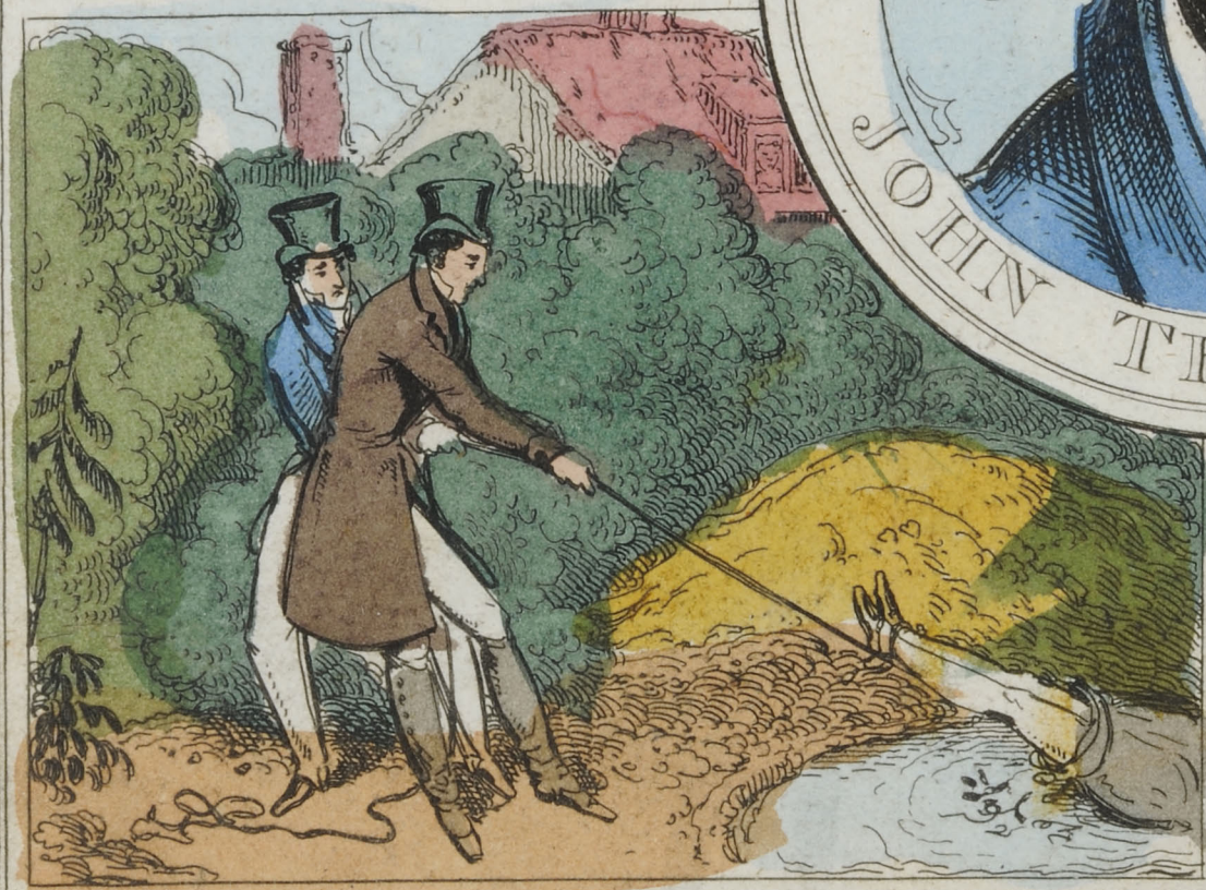
The Murderers dragging the Body out of the Pond in the Garden.