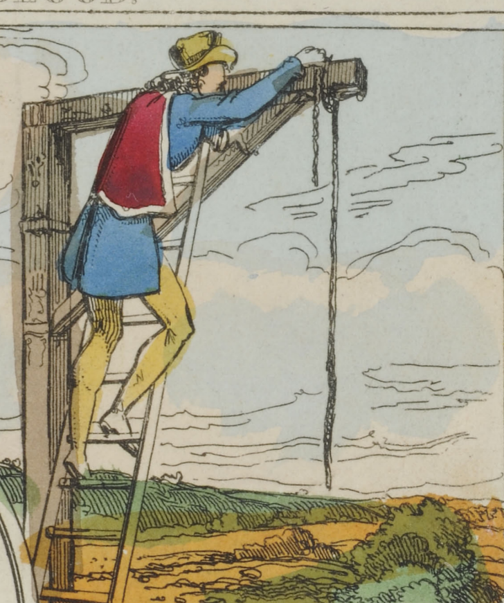
Blood preparing the Gallows for the Duke.