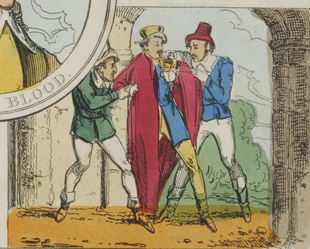
Blood taken with the Crown.