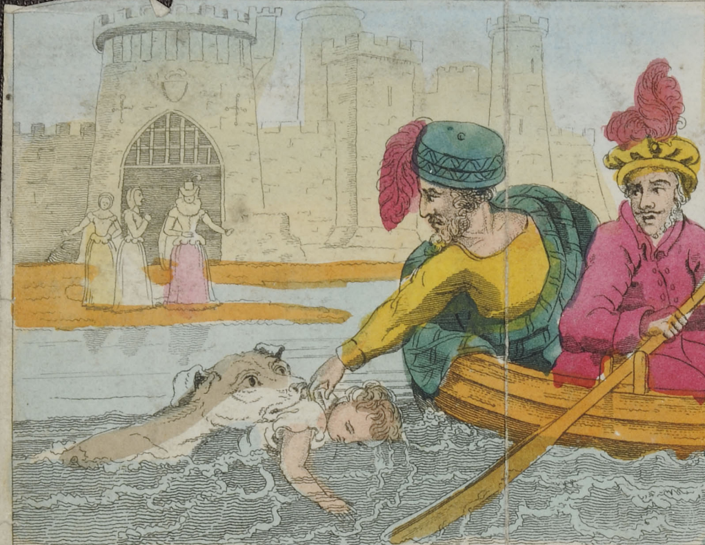
Roland Grame rescued from drowning.