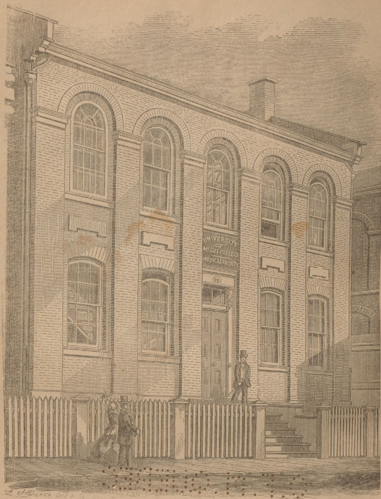
BUILDING OF THE MEDICAL FACULTY, COTÉ STREET.