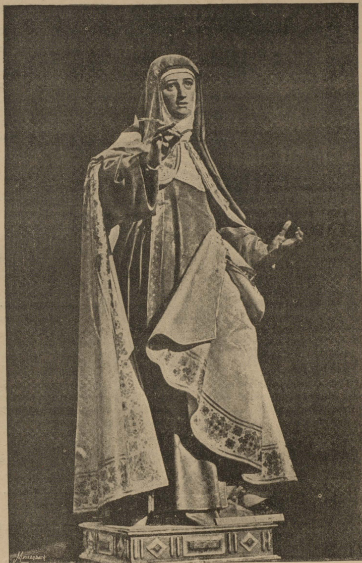
SANTA TERESA. FROM A CARVING BY GREGORIO HERNANDEZ.