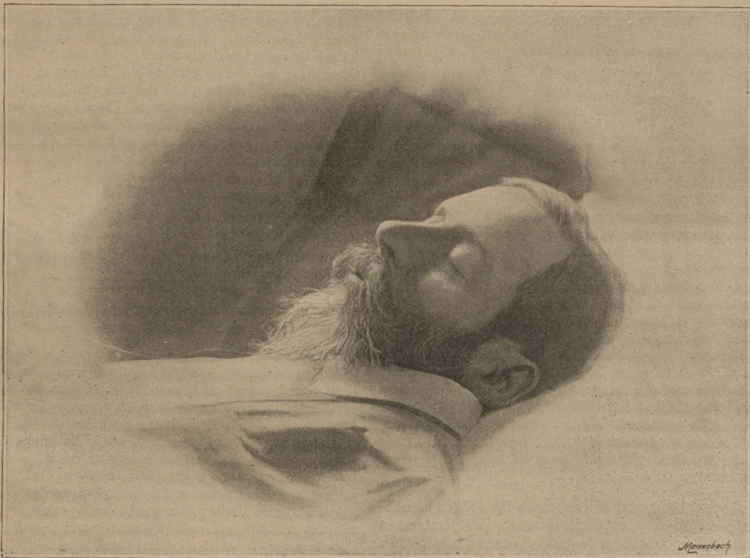
MR. STAINTON MOSES: A PHOTOGRAPH TAKEN AFTER DEATH.