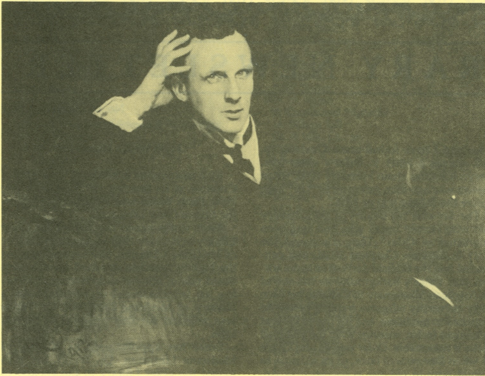
Sir Arthur Hurst by Sir Hubert von Herkomer RA