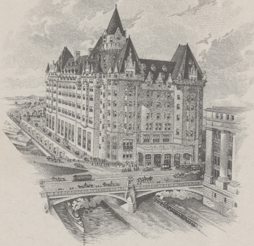
ANGUS GORDON, RESIDENT MANAGER.

2 of a small quantity of black powder is not put in until they reach Vaudreuil. At Vaudreuil the bursting charge is put in the projectile as we ship it and the projectile is assembled to the brass cartridge case with its propelling charge and primer or cap at the back end. The time fuse also is screwed in the nose end of the shell.