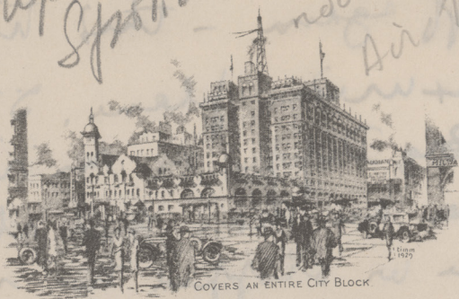
COVERS AN ENTIRE CITY BLOCK