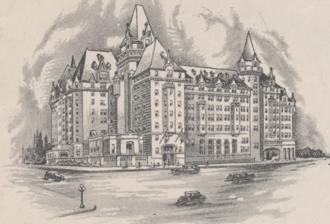
CHATEAU LAURIER OTTAWA, ONT.