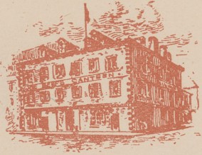
AS IT WAS.