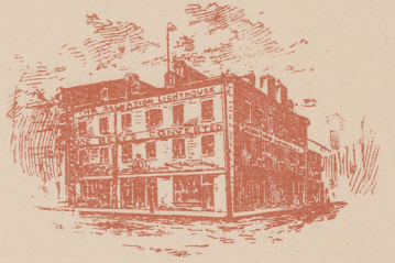
AS IT IS.