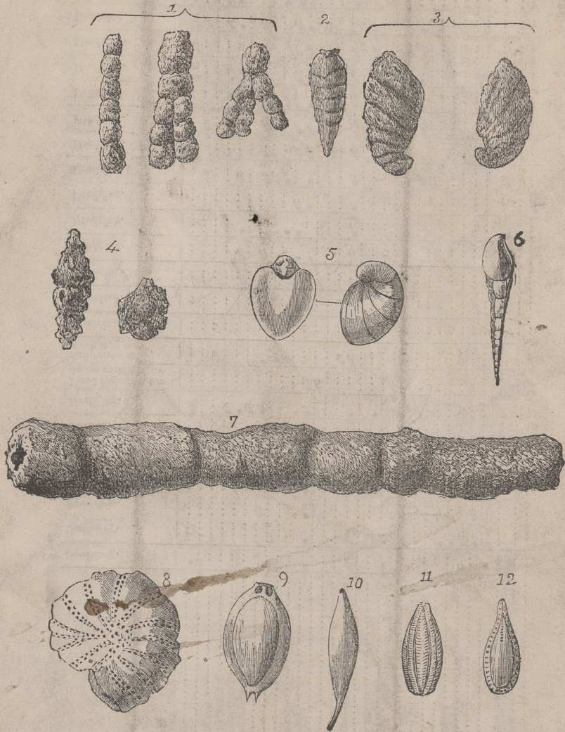
Fig. 1. Lituola findens , P. Fig. 2. Hippocrepina indivisa , P. Fig. 3. Lituola cassis , P. Fig. 4. Lituola scorpiurus . Fig. 5. Nonionina scapha , var. Labradorica (313 fms.) Fig. 6. Bulimina Preslii , var. squamosa (313 fms.) Fig. 7. Rhabdopleura ? Fig. 8. Polystomella Arctica . Fig. 9. Biloculina ringens . Fig. 10. Lagena sulcata , var. Fig. 11. Entosolenia striato-punctata . Fig. 12. Entosolenia marginata . Figs. 1, 2, 3, 4 and 7 are drawn to a scale half that of the other figures.