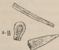
Fig. 1 (x130)

Among the most interesting bodies found in these clays are certain comblike objects which are regarded as Annelid jaws. Of these, four, all fragmentary, have been observed. They were at first supposed to be teeth from the lingual ribbon of some mollusk, but on more careful examination were found to be unlike the teeth of any mollusk of which figures can be found, and, moreover, to correspond almost exactly in form with some of the Annelid jaws described by Mr. G. J. Hinde from the Silurian and Devonian rocks of Canada.† One of the specimens shows a series of long and curved prongs. (Fig. 2.) Three others apparently belong to a single type, in which a nearly flat plate is armed along one edge with a series of small, close denticles arranged somewhat obliquely to the line of attachment. (Fig. 3.) Like the bodies last described they are of a pale straw color, differing in this respect from Mr. Hinde's specimens, which are said to be shining and black; but this difference may arise from the mode of preservation. They exhibit no reaction with polarized light, and are smooth and not distinctly granular. The ends of the prongs or denticles are worn and roughened as though by use.