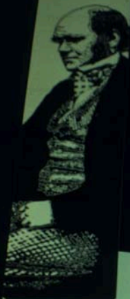
Charles Darwin 1809 - 1882