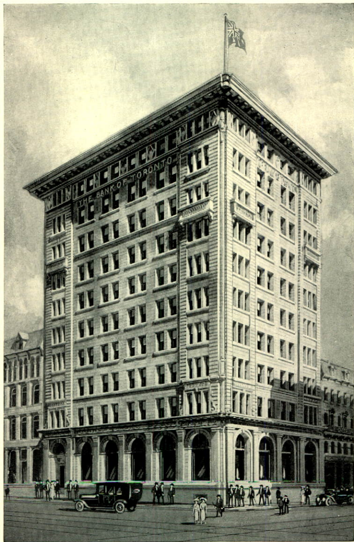
THE BANK OF TORONTO, MONTREAL