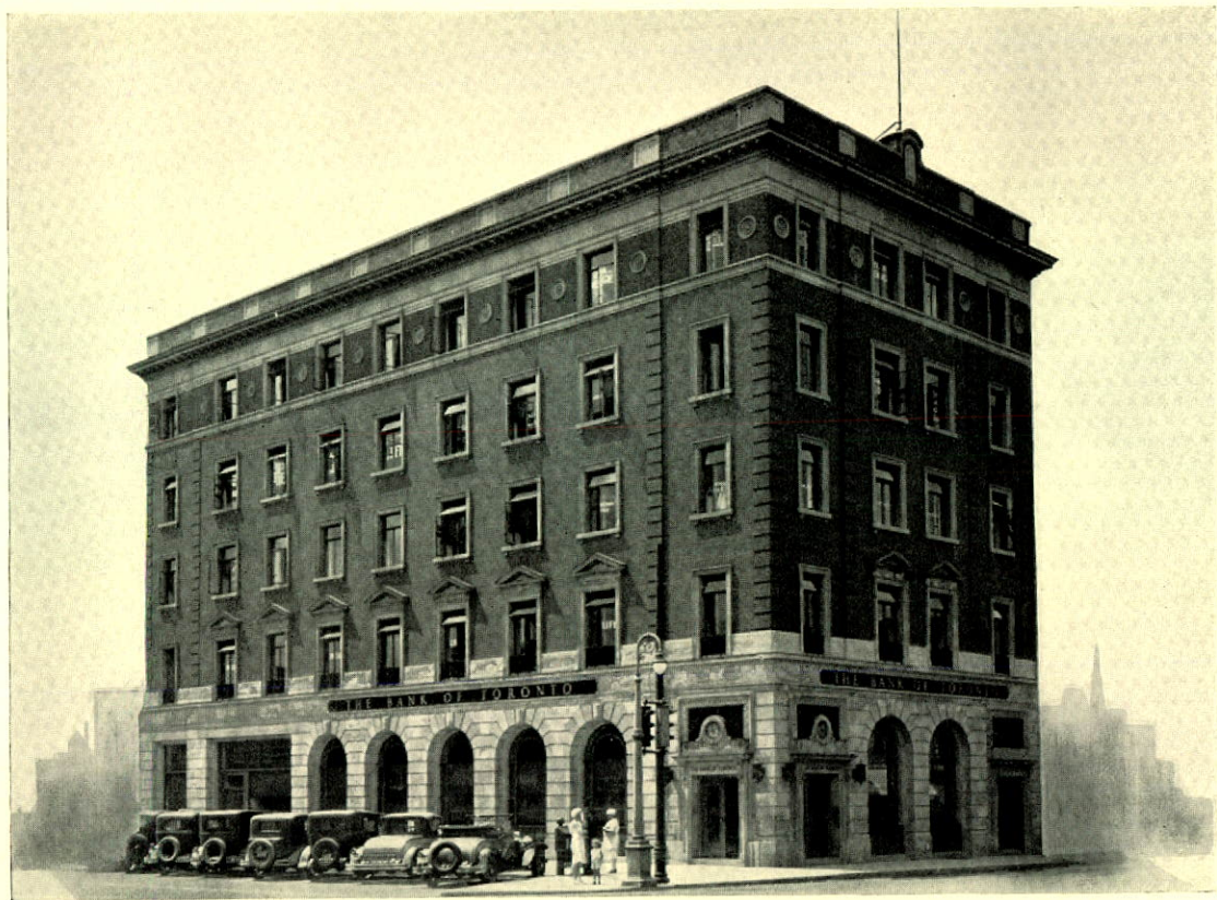
THE BANK OF TORONTO, CITY HALL BRANCH, LONDON