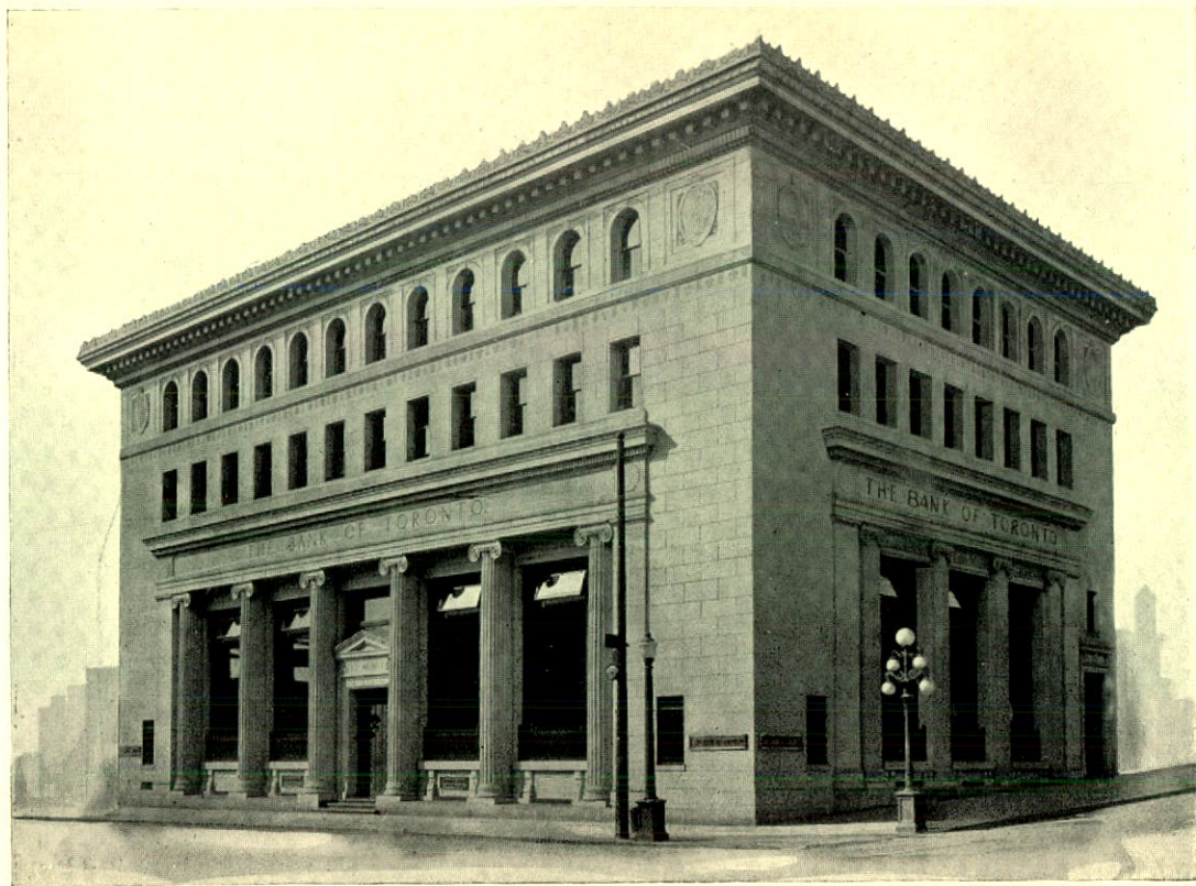
THE BANK OF TORONTO, VANCOUVER