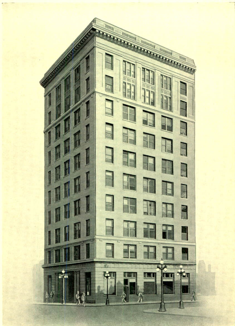
THE BANK OF TORONTO, DOUGLAS ST., VICTORIA