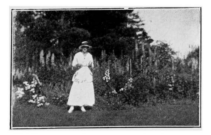
DARK FIR TREES MAKE A SPLENDID SETTING FOR THIS OLD-FASHIONED GARDEN.