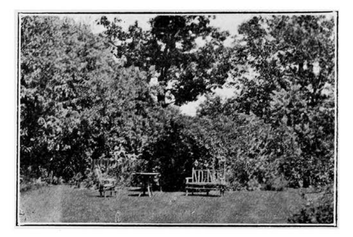
THE VINE-COVERED ARBOR IS A FAVORITE NOOK IN THE "HOLMSLEIGH" GARDEN.