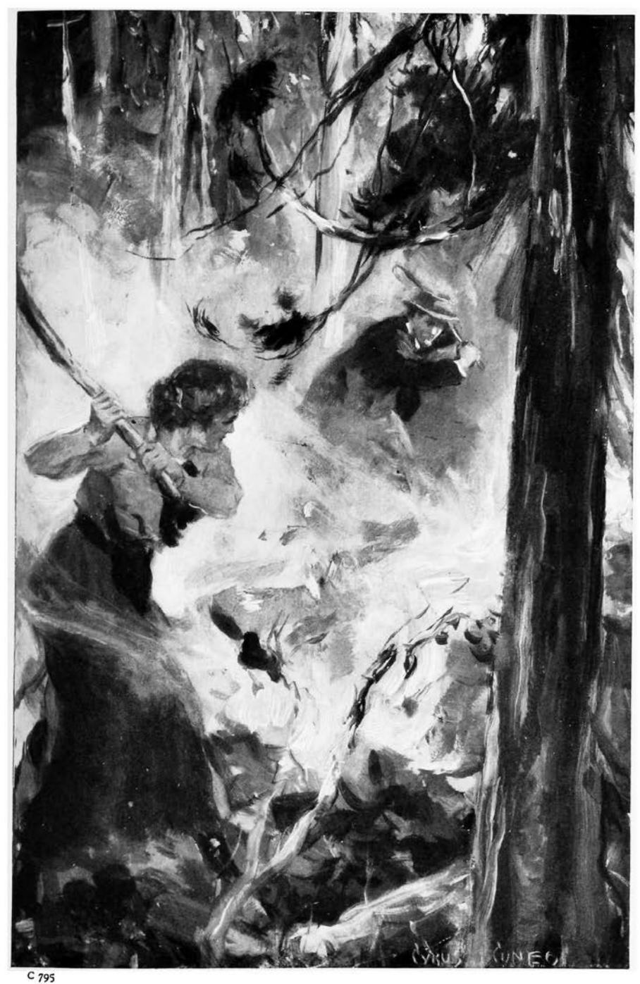
C795 "PAM STARTED FORWARD AND COMMENCED HITTING WILDLY, RAISING A SHOWER OF SPARKS