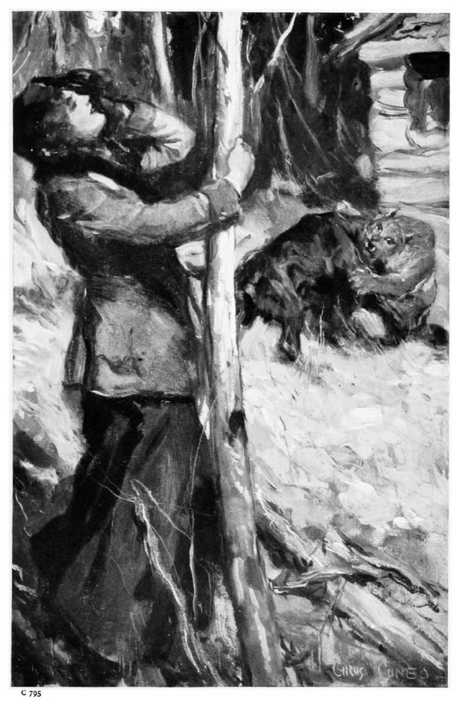
"THE DOG AND THE UNKNOWN FURY WERE ROLLING OVER IN THE DEADLIEST OF COMBATS"