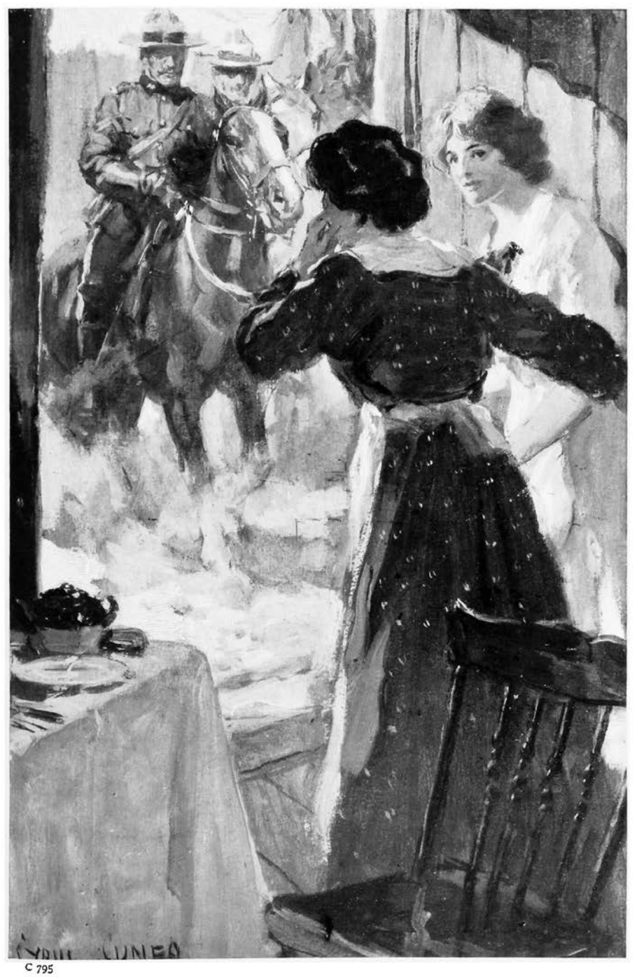
"'COURAGE, PAM!' CRIED SOPHY. 'I AM AFRAID SOMETHING MUST HAVE HAPPENED TO YOUR GRANDFATHER'"