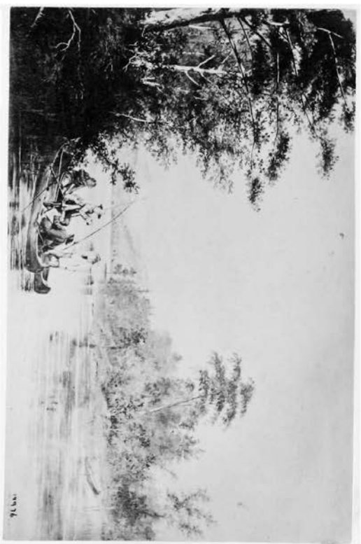
Lake St. Charles, near Quebec.