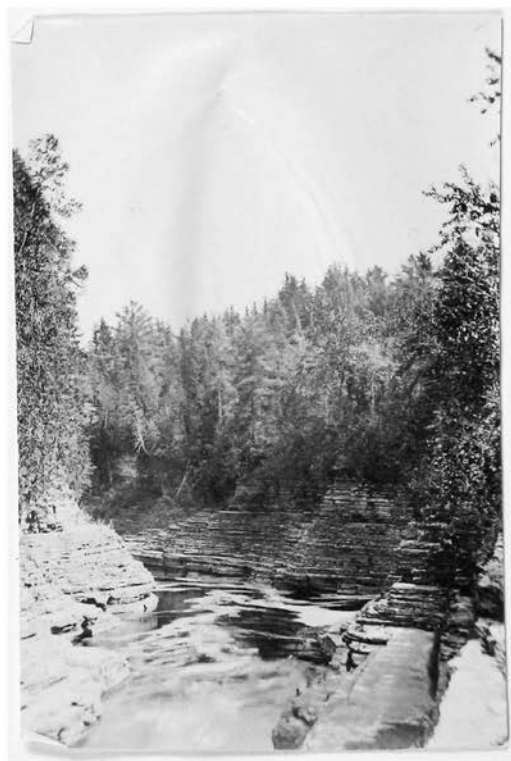
Natural Steps, Montmorenci, near Quebec.