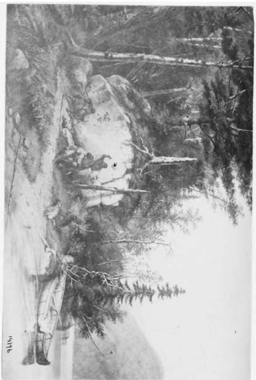
Indian Camp on the Road to Lake St. John—(by Kreighoff).