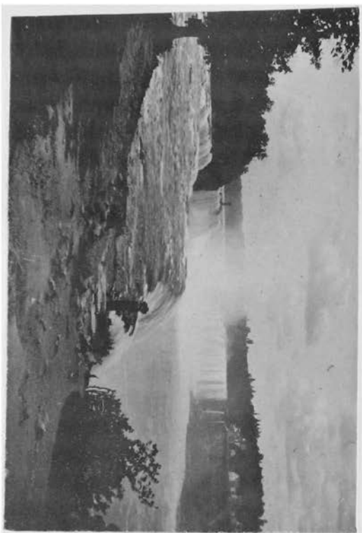
General View of Niagara, from American side.