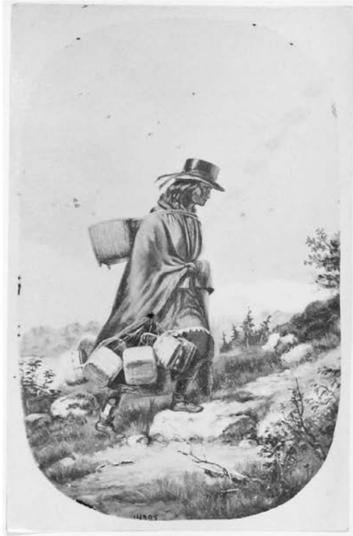
The Squaw—Basket Maker—(by Kreighoff).