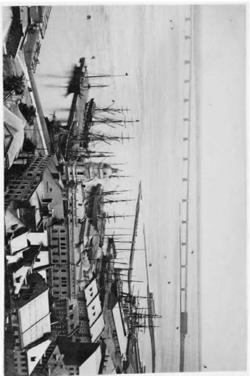
Montreal Harbour with Victoria Bridge.