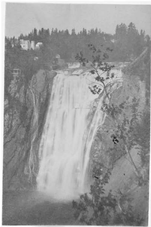
Montmorenci Falls, near Quebec.