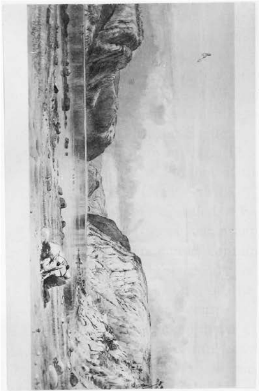
Calm on the Saguenay.