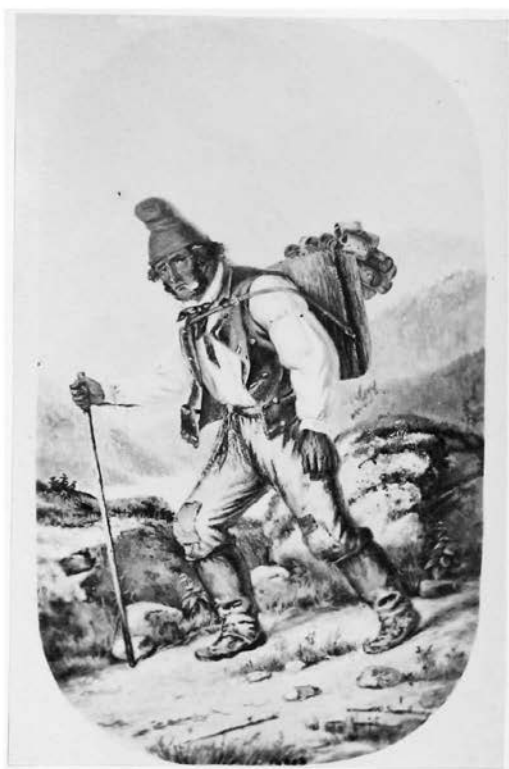
The Habitant—Berry Gatherer—(by Kreighoff).