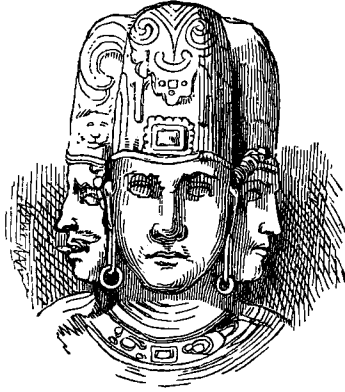
THE HINDOO TRIMURTI.

the good and beneficent "Preserver," the friend and mediator for man, is a purely Greek face; the Nose straight and well-defined. It has none of the air of the modern Hindoo countenance. Much less has that of the energetic and terrible Siva, "the Destroyer." The Nose