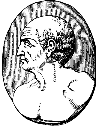
CATO THE CENSOR.

These names are only selected because they afford well-known and easily verifiable instances, requiring neither pictorial nor biographical illustration. Energy may be equally conspicuous in any other department of life, and display itself as fully in the civilian as in the warrior. Two of the individuals adduced are striking instances of this:—Cato the Censor, and the Earl of Chatham. They were men of remarkable parallelism of character, and, though differing in other facial features, their Noses were very similar.