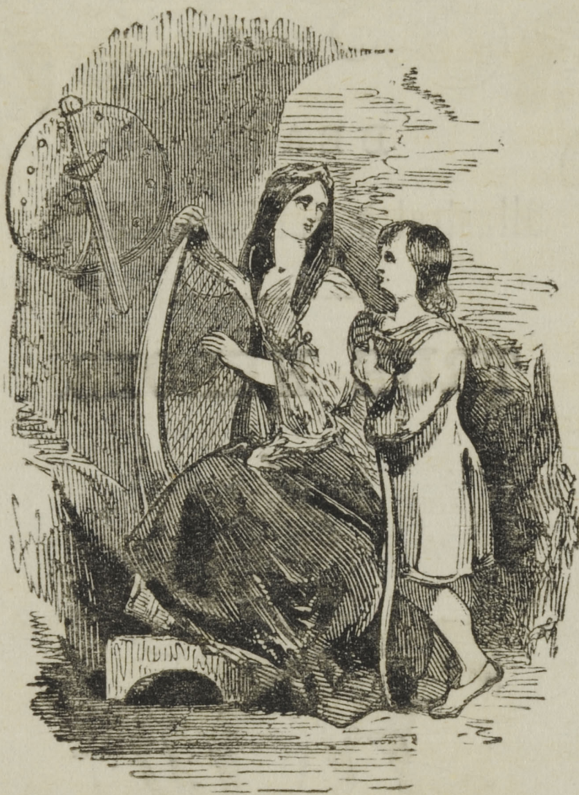
ALFRED THE GREAT.