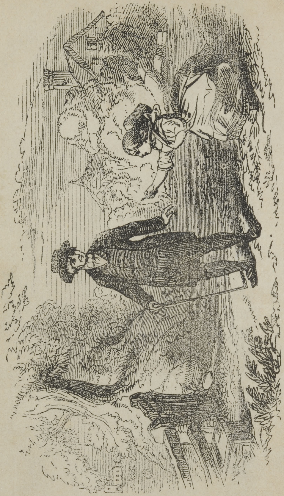
“ I THINK THIS BELONGS TO YOU, SIR. ”