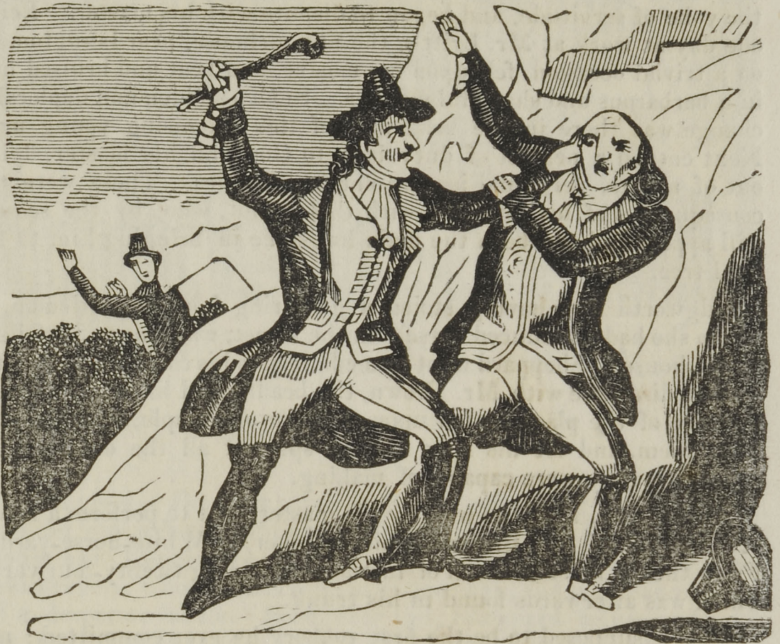
[ Jack Sheppard beating his Master. ]