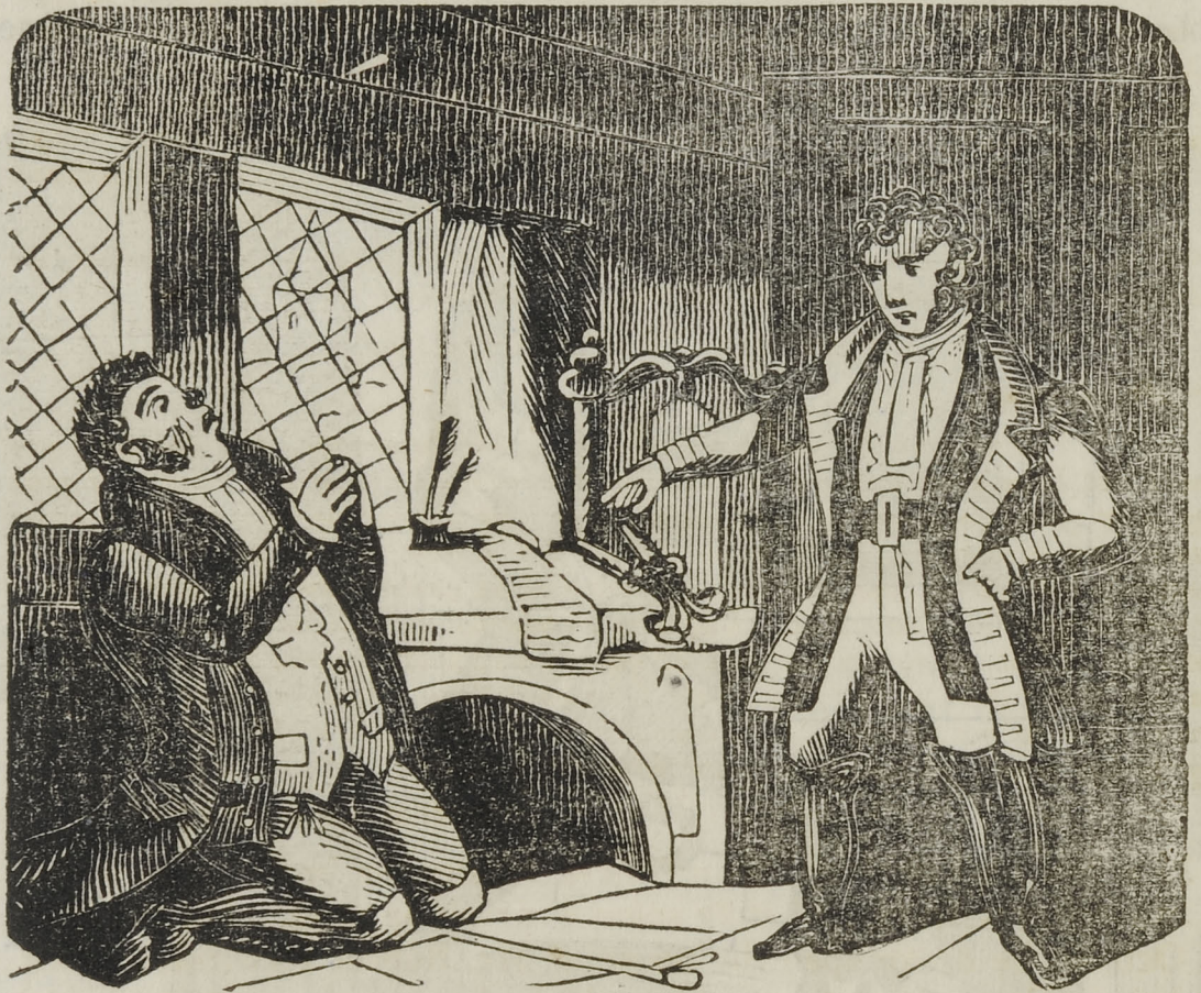
[The Law Stationer imploring Sheppard not to rob him.]

Clerkenwell Bridewell lie contiguous to each other, and that Sheppard and Bess got into the yard of the latter, where they had a wall of 22 feet high to scale before their liberty was perfected. Sheppard, far from being unprepared to surmount this difficulty, had his gimblets and piercers ready, and made a scaling-ladder. While the keepers and prisoners of both places were asleep in their beds, he mounts with his lady, and in less than ten minutes gets over the wall with her, completing his liberation. His escape from the condemned hole in Newgate made a far greater noise in the world than that from the New Prison ; and it has been allowed by all the gaol-keepers, in London, that one so extraordinary was never before performed in England. The broken chairs and bars are kept at the New Prison to testify the fact and preserve the memory of the villain.