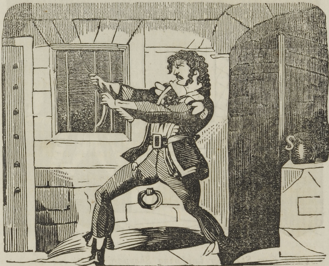
[ Sheppard making his escape from the condemned hole. ]

gate ward. Sheppard, conscious of his crime, and knowing the information he had made to be but a blind scheme, that would avail nothing, began to meditate an escape. They had been thus detained four days, when their friends, having the liberty of seeing them, furnished Jack with implements proper for his design; accordingly he went to work, and, on the 25th of May, being Whitsunday, at about two o'clock in the morning, completed a practicable breach, and sawed off his fetters; having, with unheard of diligence and dexterity, cut off an iron bar from the window, and took out a mutin or bar, of the most solid oak, about nine inches in thickness, by boring it through in many places, with great skill and labour.—They had still twenty-five feet to descend. Sheppard fastened a sheet and blankets to the bars, caused madam to take off her gown and petticoat, and sent her out first. She being more corpulent than himself, it was with great difficulty he got her through the opening; but, on observing his directions, she was instantly down, more frightened