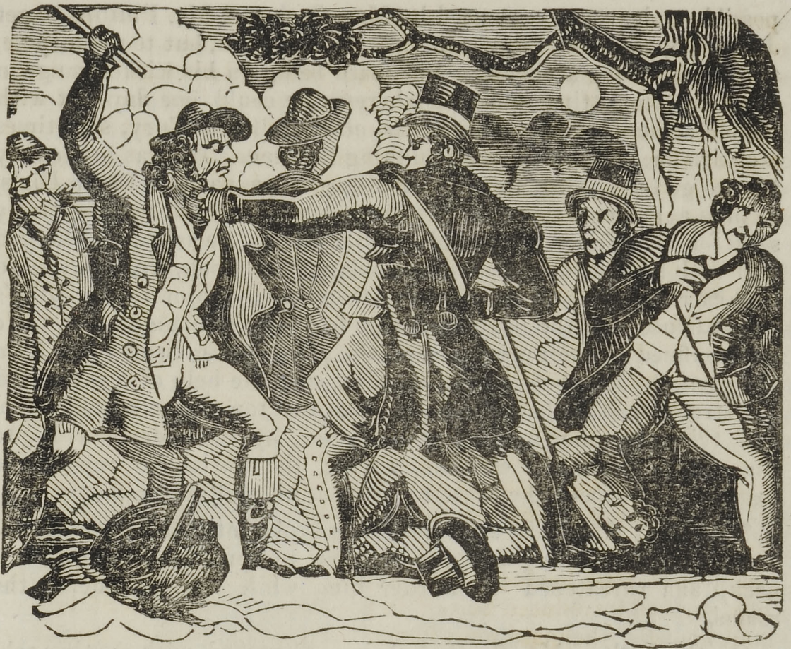
[ Jack Sheppard and his Comrades encountering the Game-keepers. ]

Blueskin ; — Dowling ; James Sykes, alias Hell and Fury, by whom he was seduced into every kind of vice ! After breaking into a house near Kennington, they were all nearly apprehended by some game-keepers, who happened to pass that way, and with whom they had a desperate battle. Soon after this, Sheppard being on horse-back, met his late master near Finchly, whom he first robbed, and then tying him on his horse, with his face towards his tail, flogged him unmercifully with a whip.