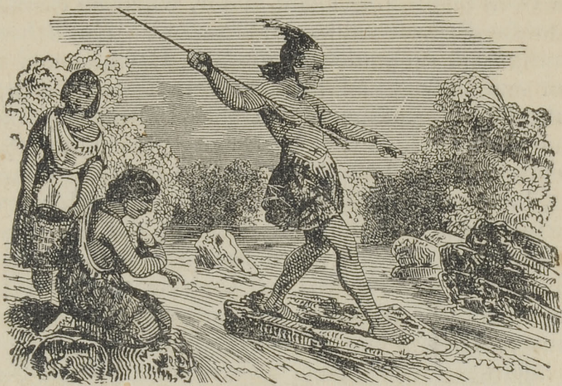
Kiodago at the Fishing Station.

Chevalier de Grais, the former having the chief command of the expedition, were sent upon this duty, with Hanyost to guide them to the village of Kiodago. Many hours were consumed upon the march, as the soldiers were not yet habituated to the wilderness; but just before dawn, on the second day, the party found themselves in the neighborhood of the Indian village.