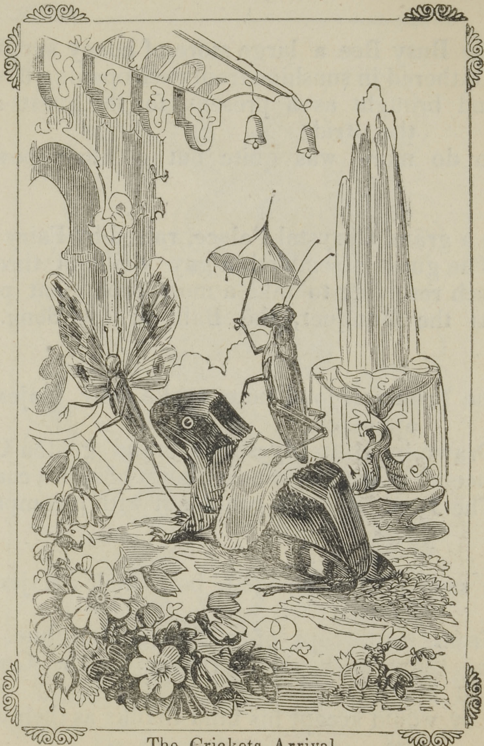
The Crickets Arrival.