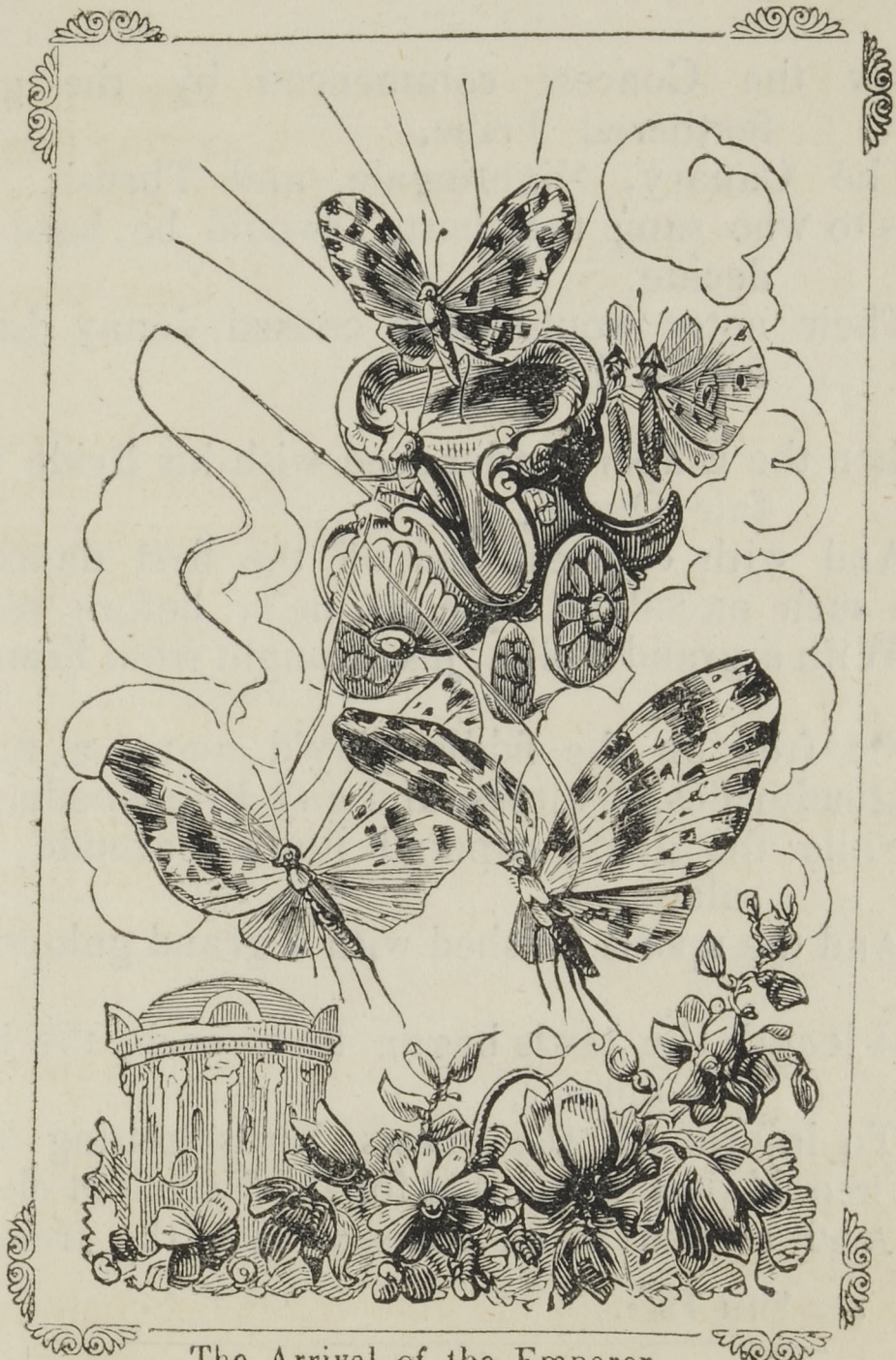
The Arrival of the Emperor.