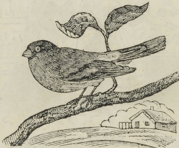
THE BULL FINCH.