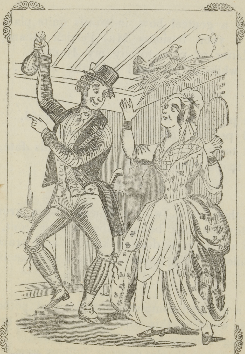
Paddy's Return Home.