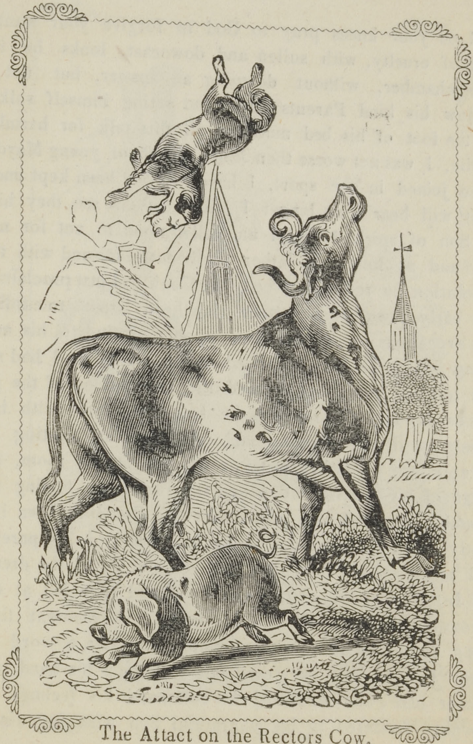
The Attack on the Rectors Cow.