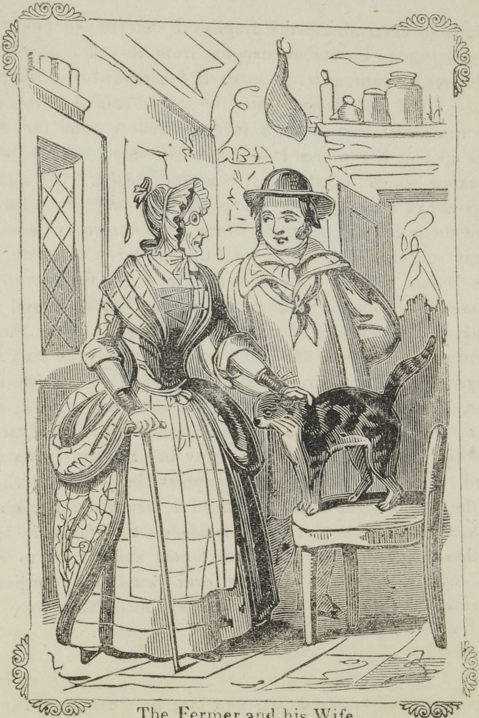
The Farmer and his Wife.