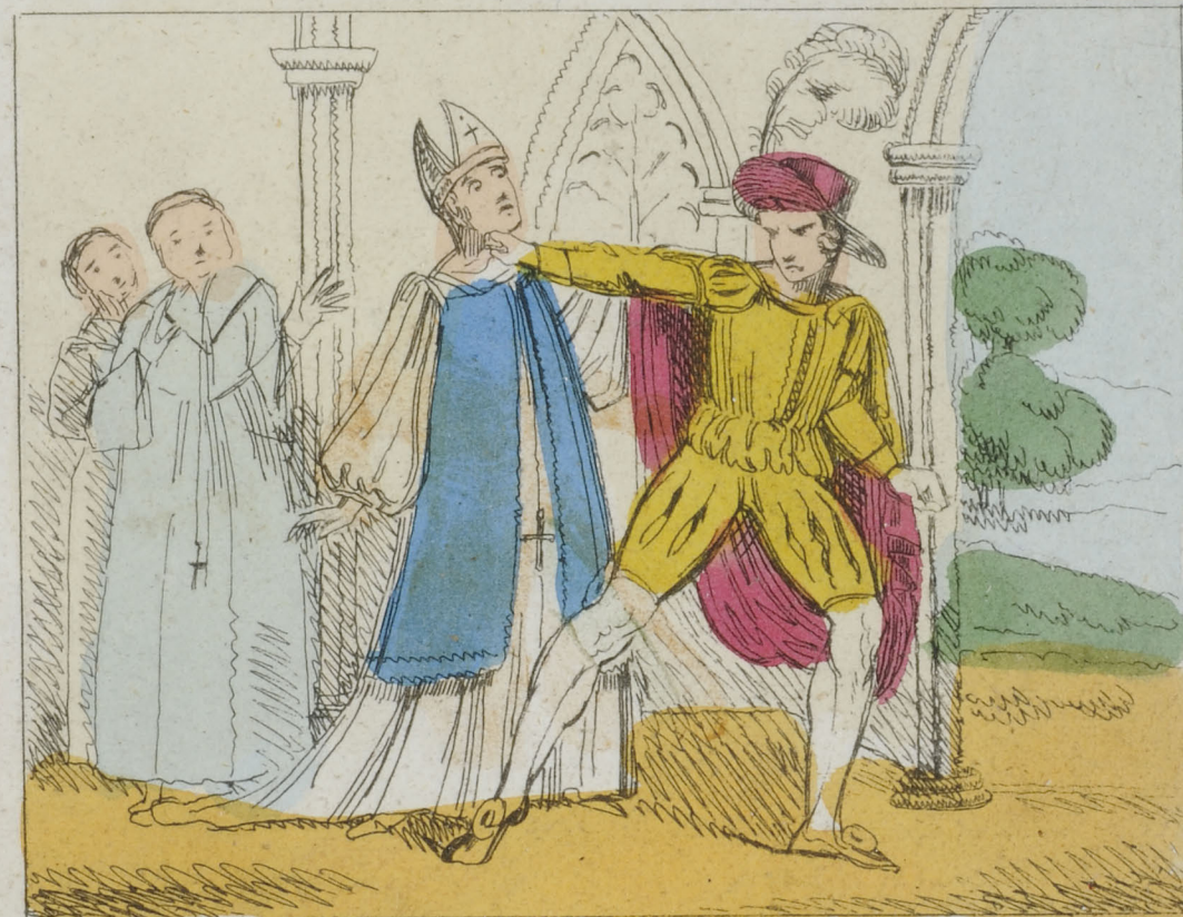
M. Faliero strikes the Bishop of Treviso.