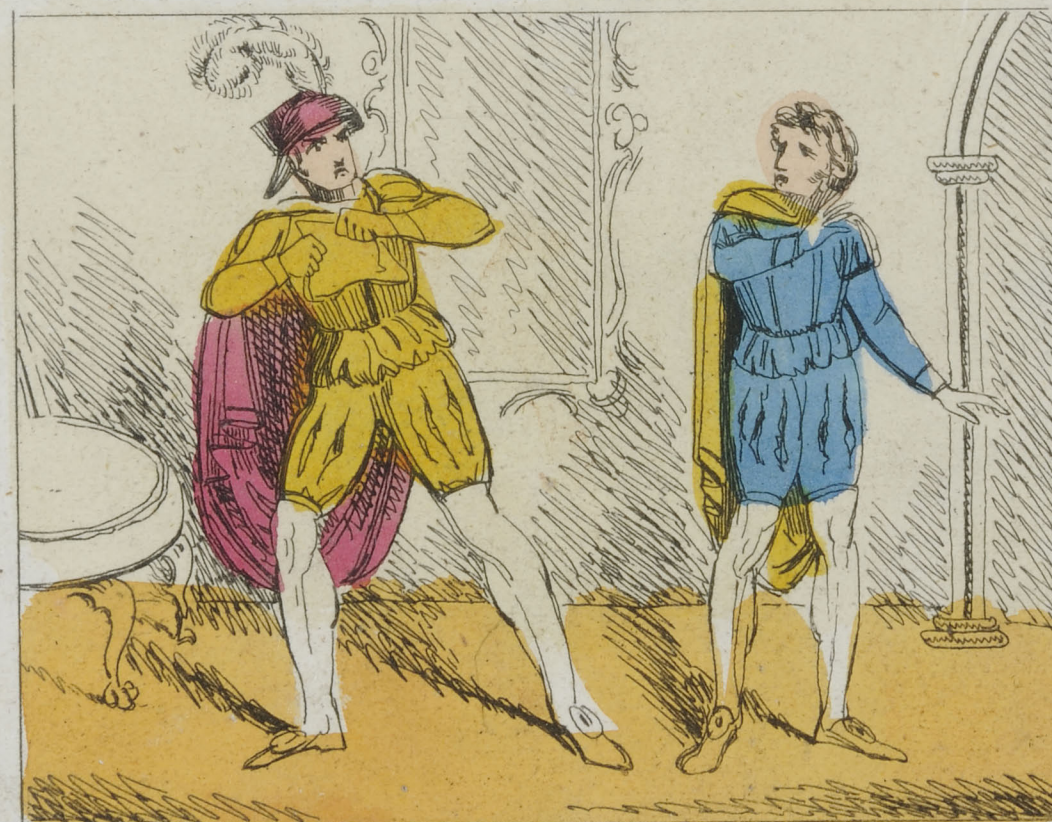
The Doge destroys the Sentence passed on M. Steno.