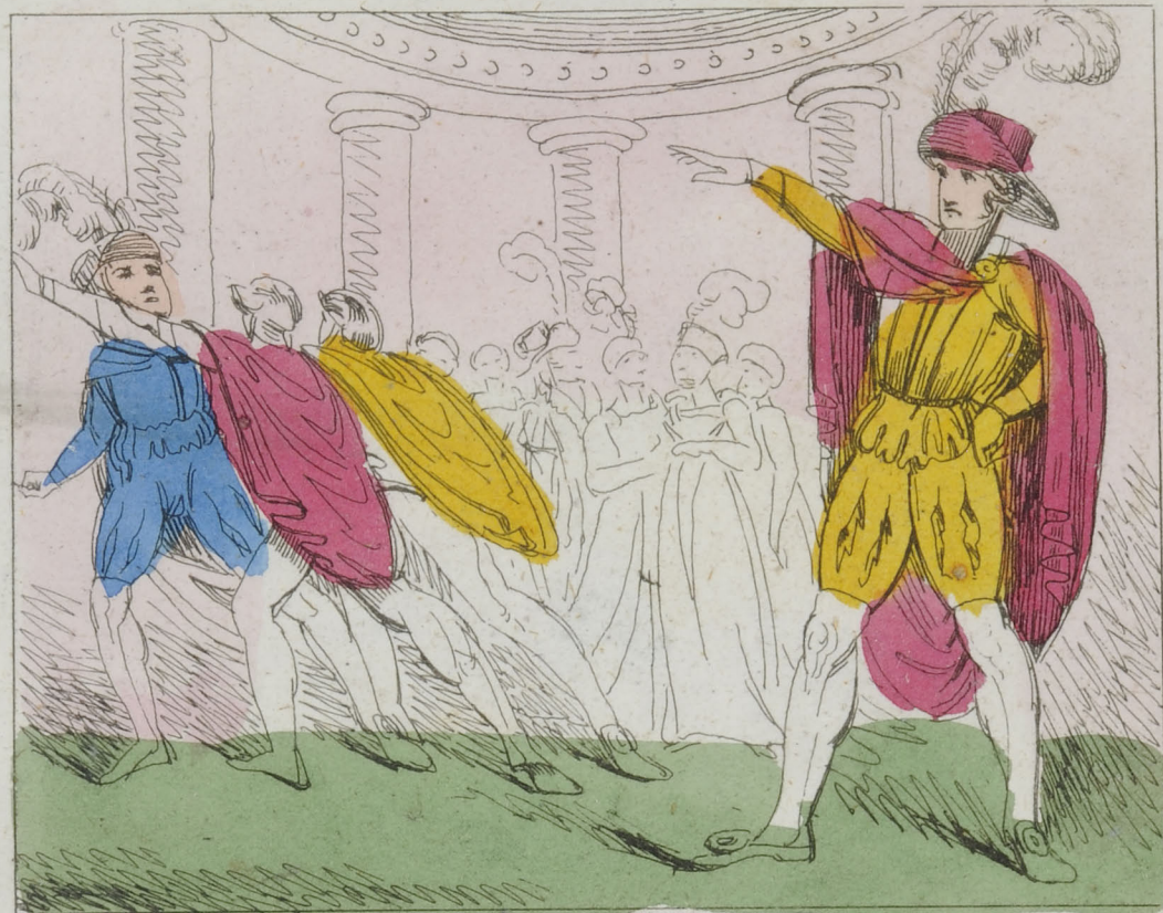
M. Faliero orders Michael Steno out of the Saloon.