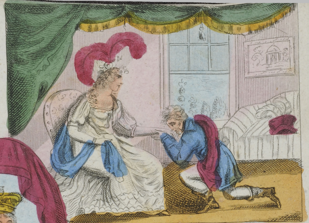
Count Kaminismark taking leave of the Princess of Zell.