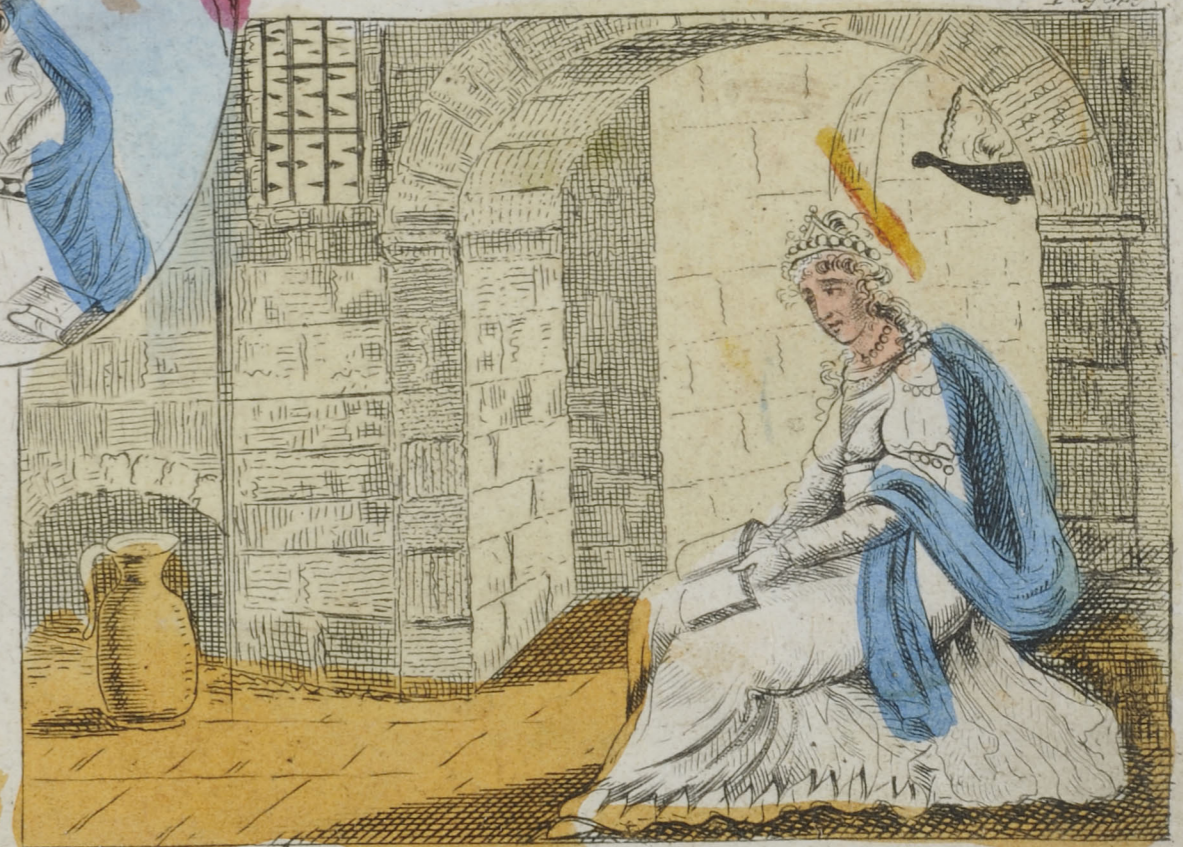
The Princess of Zell confined in the Castle of Ahlen.