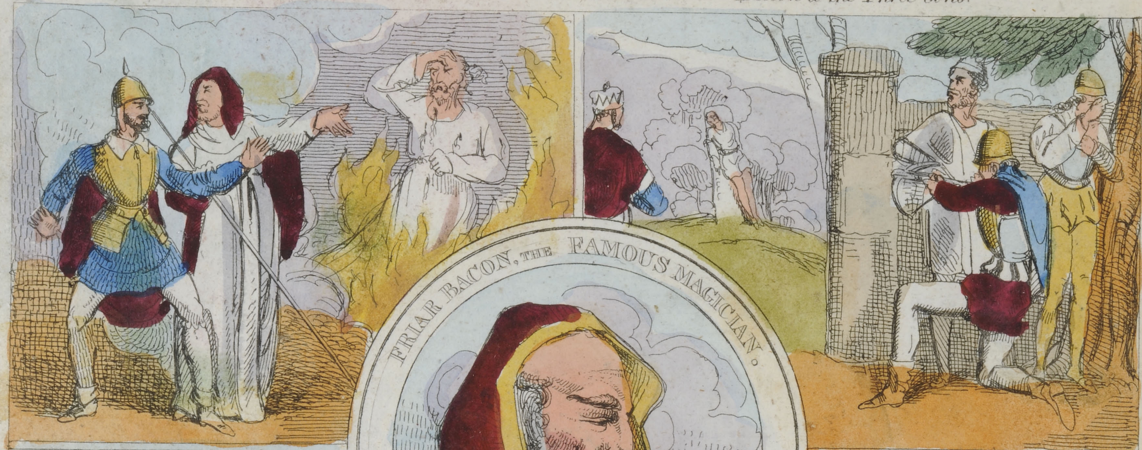
Bacon & the Three Sons.