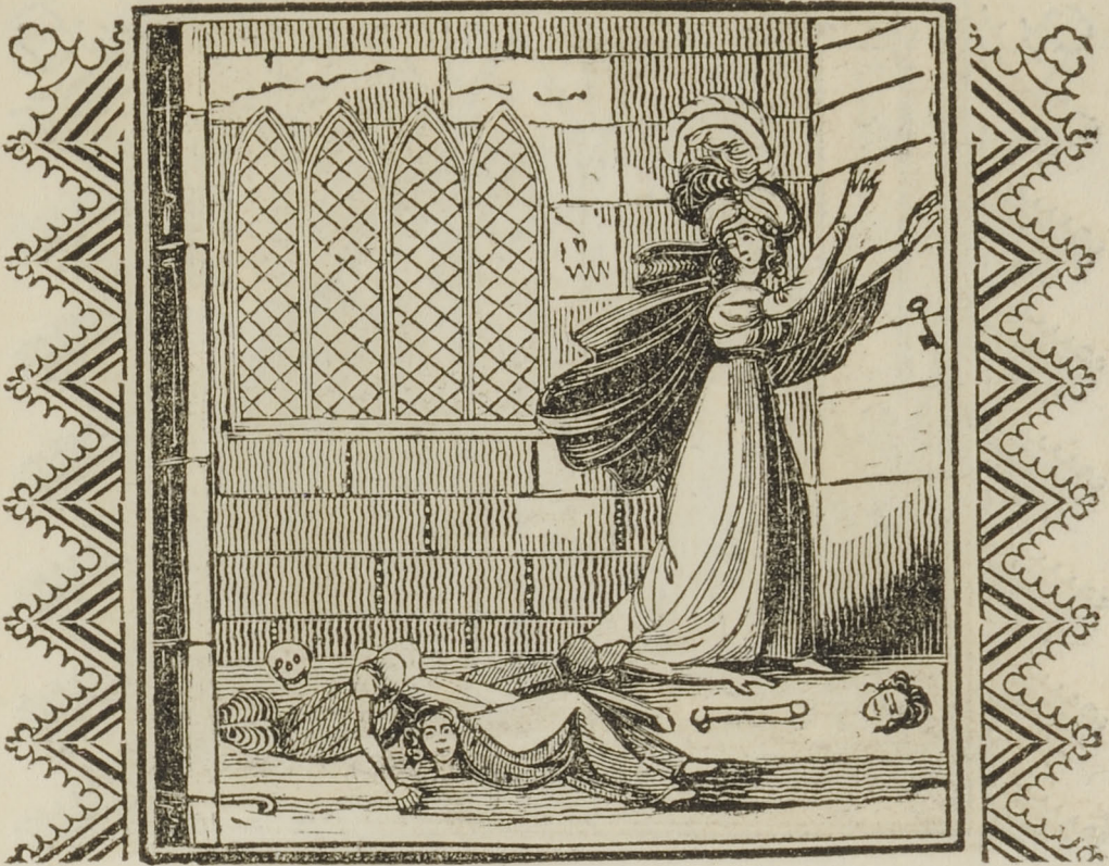
Blue Beard's Wife in the Blue Chamber.

asked her for the keys, which she gave him, but with such a trembling hand, that he easily guessed what had happened. "What!" said he, "is not the key of my closet among the rest?" "I must certainly," answered she, "have left it above upon the table." "Fail not," said Blue Beard, "to bring it to me presently."