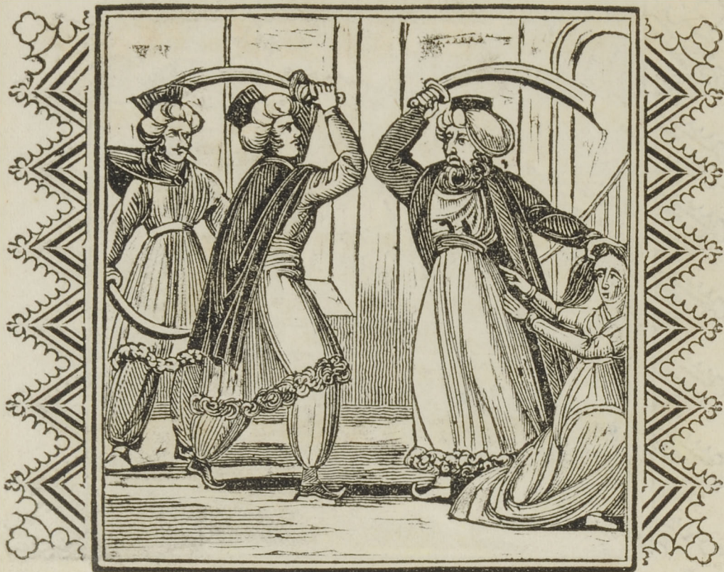
The Brothers killing Blue Beard, to save their Sister's Life.

herself. "No, no," said he, "recommend thyself to God;" and was just ready to strike. At this very instant, there was such a loud knocking at the gate, that Blue Beard made a sudden stop. The gate was opened, and presently entered two horsemen, who, drawing their swords, ran directly to Blue Beard.