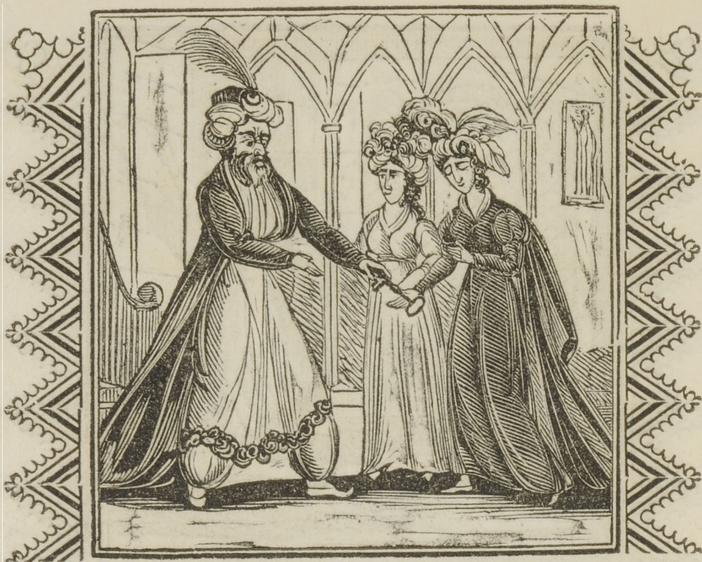
Blue Beard's Wife returning the Key.

eyes all bathed in tears, "give me some little time to say my prayers." "I give you," replied Blue Beard, "half a quarter of an hour, but not one moment more."