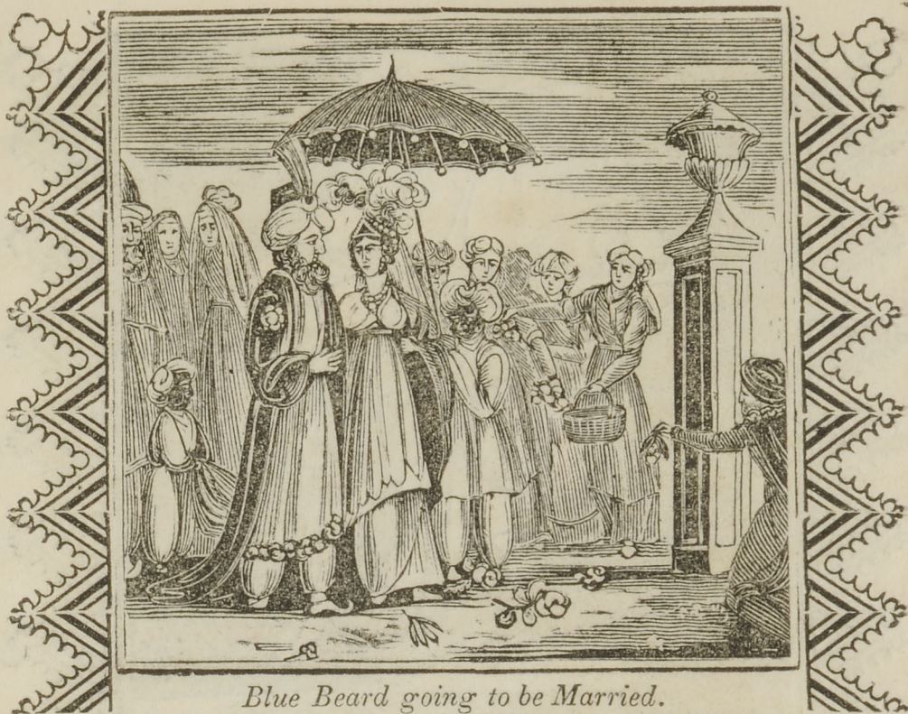
Blue Beard going to be Married.

seemed to pass one another. After that, they went into the two great rooms, which were the best and richest furniture; they could not sufficiently admire the number and beauty of the tapestry, beds, couches, cabinets, stands, tables, and looking-glasses, in which you might see yourselves from head to foot: some of them were framed with glass; others with silver, plain and gilded, the finest and most magnificent ever seen. They ceased not to extol and envy their happiness of their friend, who, in the mean-time, no way diverted herself in looking upon all these rich things, because of the impatience she had to go and open the closet on the ground-floor. She was so much pressed by her curiosity, that, without considering that it was very uncivil to leave her company, she went down a little back staircase, with such excessive haste, that she had twice or thrice like to have broken her neck.