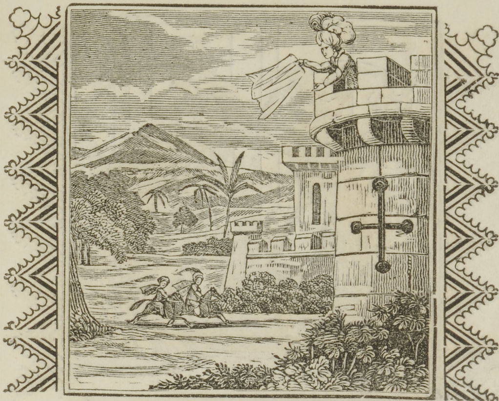
Ann waving her Handkerchief to her Brothers.

up to you." "I am coming," answered his wife; and then she cried, "Anne, sister Anne, dost thou not see any one coming?" "I see," replied sister Anne, a great dust which comes on this side here." "Are these my brothers?" "Alas! no, my dear sister, I see a flock of sheep." "Will you not come down?" cried Blue Beard. "One moment longer," said his wife; and then she cried out, "Anne, sister Anne, dost thou see any one coming?" "I see," said she, "two horsemen coming, but they are a great way off." "God be praised!" replied the poor wife joyfully, "they are my brothers." "I am making them a sign," said sister Anne, "as well as I can, for them to make haste." Then Blue Beard bawled out so loud, that he made the whole house tremble.