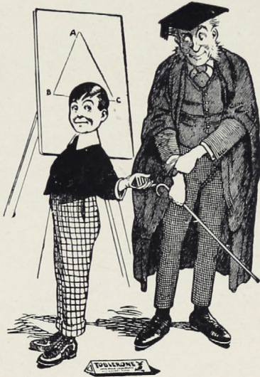
Tickles Even Tommy's Tutor

EATING TOBLERONE is a pleasure so exquisite that the mere thought alone brings happy reminiscent smiles. To eat one piece is to create the desire for more—and still more.