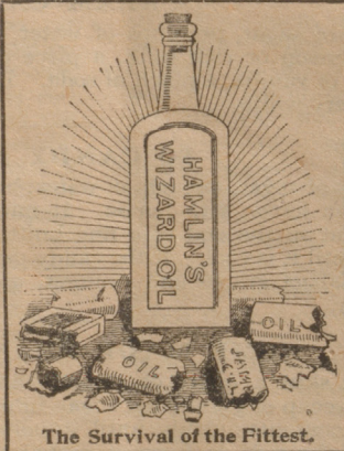
The Survival of the Fittest.

SYMPTOMS —During the first stages the symptoms are very much like rheumatism, but as the disease increases the pain becomes more deep-seated and severe and requires active measures for its relief. Spasmodic twitching, especially at night, a flabbiness of the skin and a wasting of the flesh marks the progress of the disease until finally deformity takes place. The parts are unnaturally hot, and a peculiar glossy, shining appearance of the skin announces, "white swelling." The joints become more and more inflamed and distended with matter which gradually makes its way to the surface and bursts through the skin. The appetite and sleep are disordered and diarrhoea sets in.