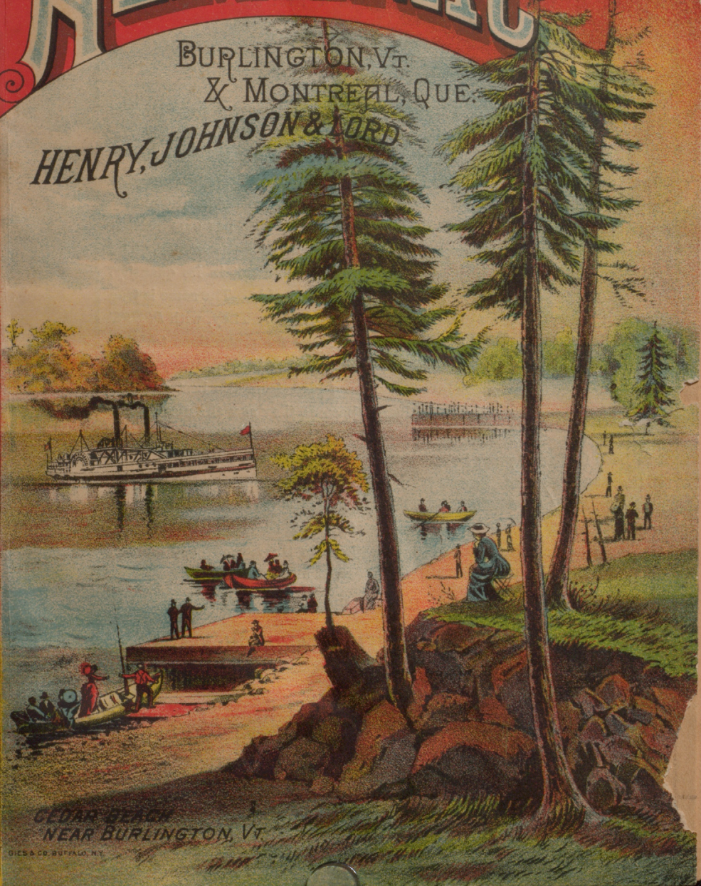
CEDAR BEACH NEAR BURLINGTON, VT.