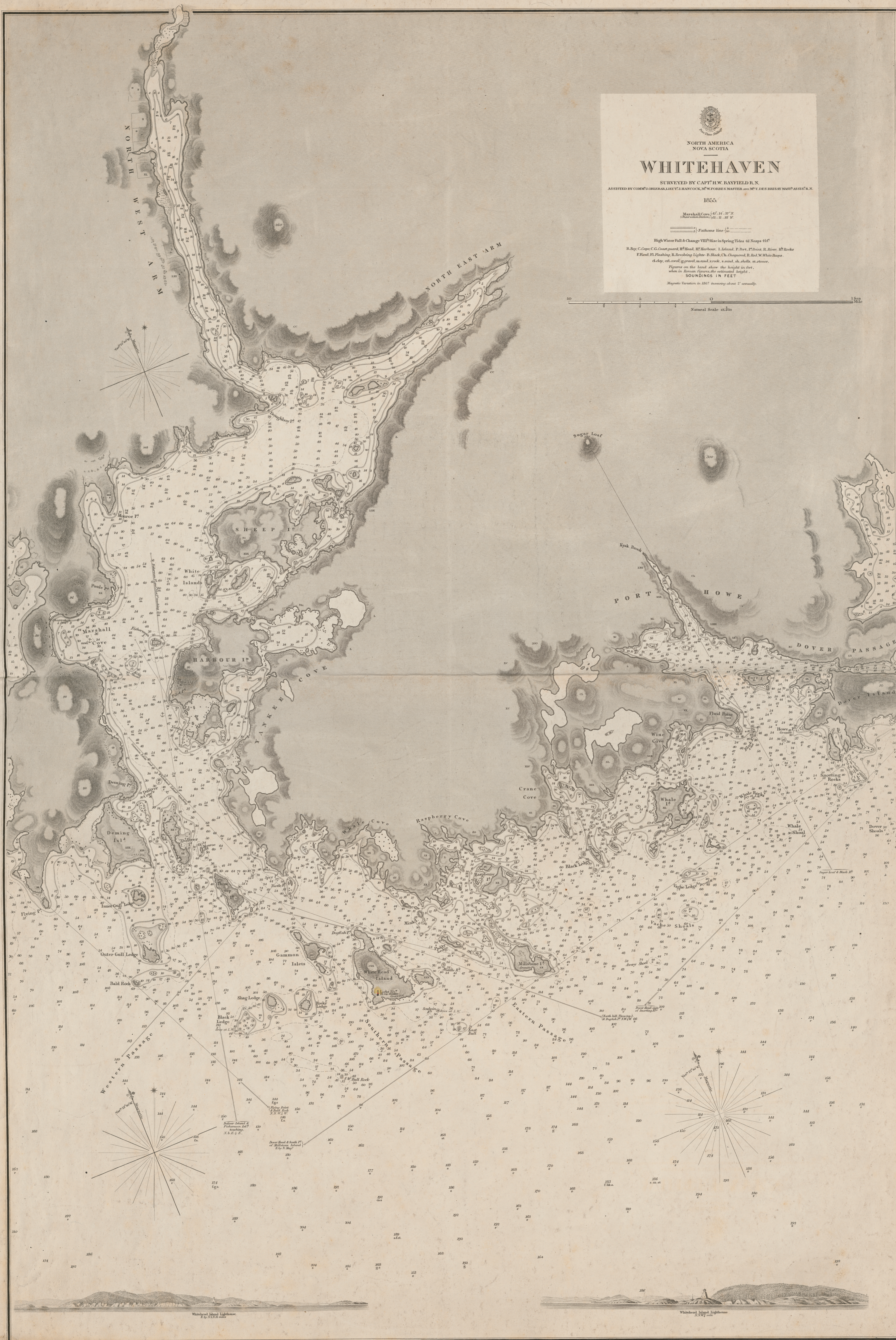
Whithead Island Lighthouse E by N 1/2 N miles