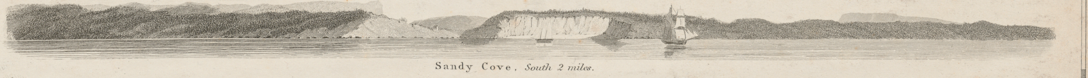
Sandy Cove, South 2 miles.