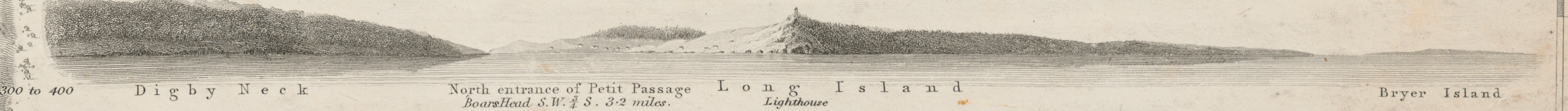
Digby Neck North entrance of Petit Passage Long Island Bryer Island South of Digby Neck 3.5 miles