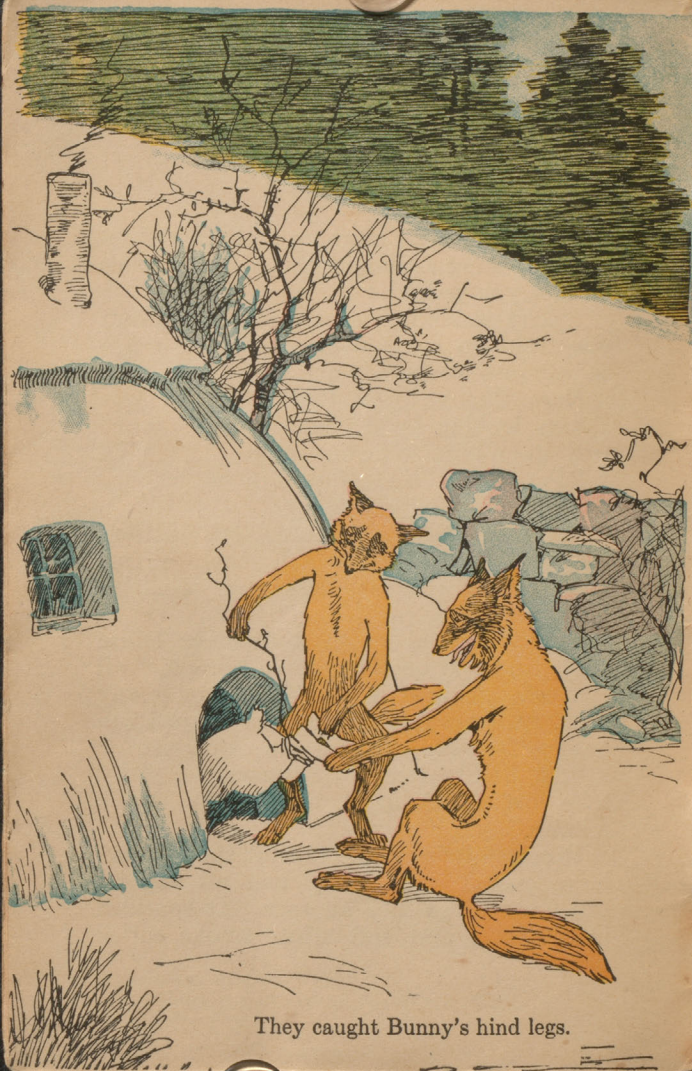
They caught Bunny's hind legs.