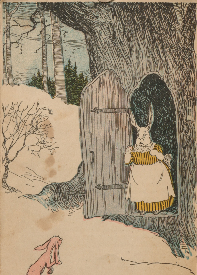
At the door stood Mrs. Rabbit.