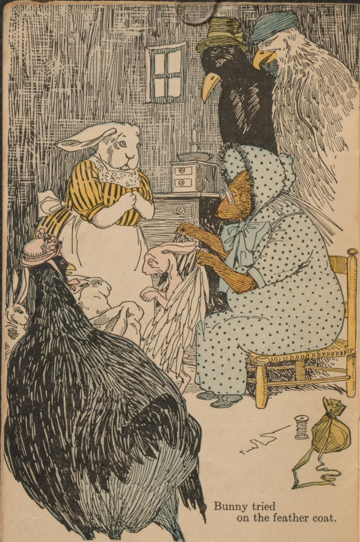
Bunny tried on the feather coat.