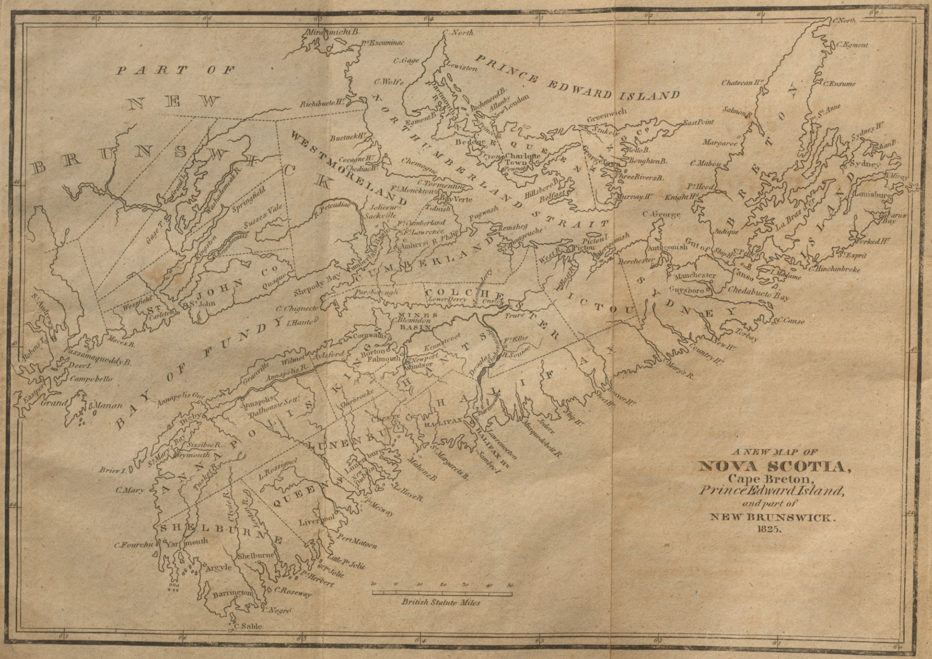
A NEW MAP OF NOVA SCOTIA, Cape Breton, Prince Edward Island, and part of NEW BRUNSWICK. 1825.