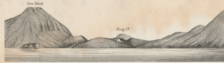
Leading Mark for entering Sailors Harbour