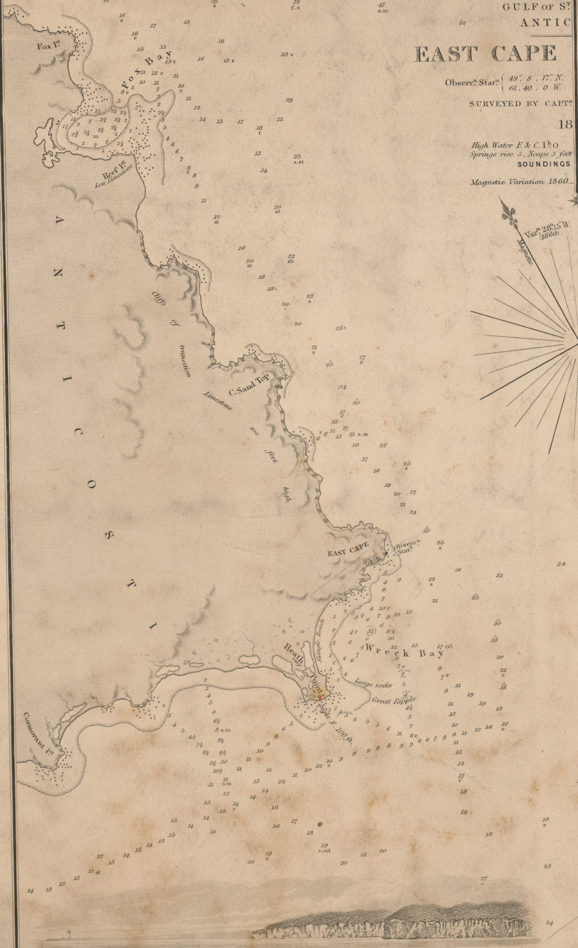
Anticosti Isl d - Heath Point Lighthouse. W.S.W. 4 miles.